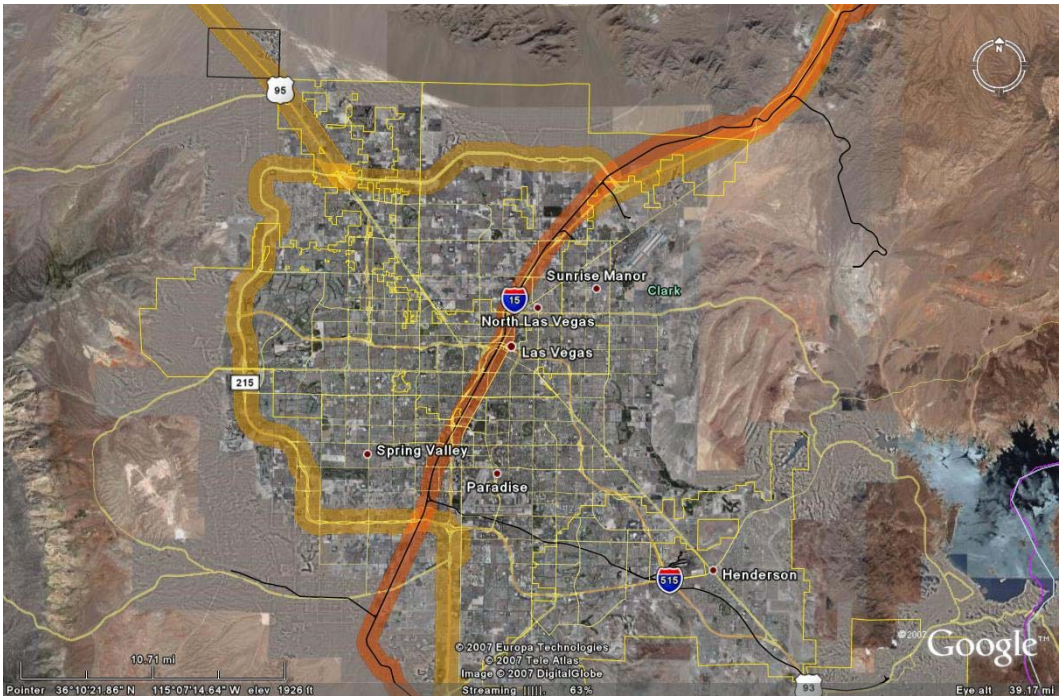
Fig. 3. Potential Rail and Highway Routes through Las Vegas