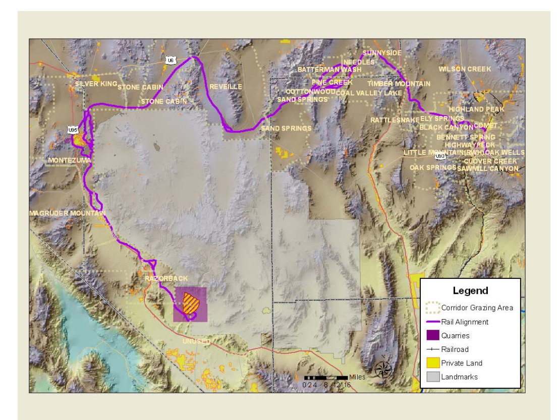
Fig. 2. Caliente Rail Alignment

Studies prepared for the State of Nevada estimate that at least 95,000 residents of Clark County live within one-half mile of the Union Pacific rail route DOE would have used for shipments to Yucca Mountain via Caliente, and at least 113,000 residents of Clark County live within one-half mile of the highway routes DOE would have used for truck shipments. A large portion of the world-famous Las Vegas "Strip" and more than 34 hotels with 49,000 hotel rooms are located within what would have been the one-half mile region of influence along the rail route. Nevada estimates at least 40,000 nonresident visitors and workers in Clark County would have been located within one-half mile of the highway and rail routes at any hour of the day. Virtually all of Clark County's 1.8 million residents live within what would have been the 50-mile radiological region of influence for transportation accidents and sabotage.[19] None of this was considered in the early site selection process and failure to do so, contributed significantly to the accumulating problems with Yucca Mountain.