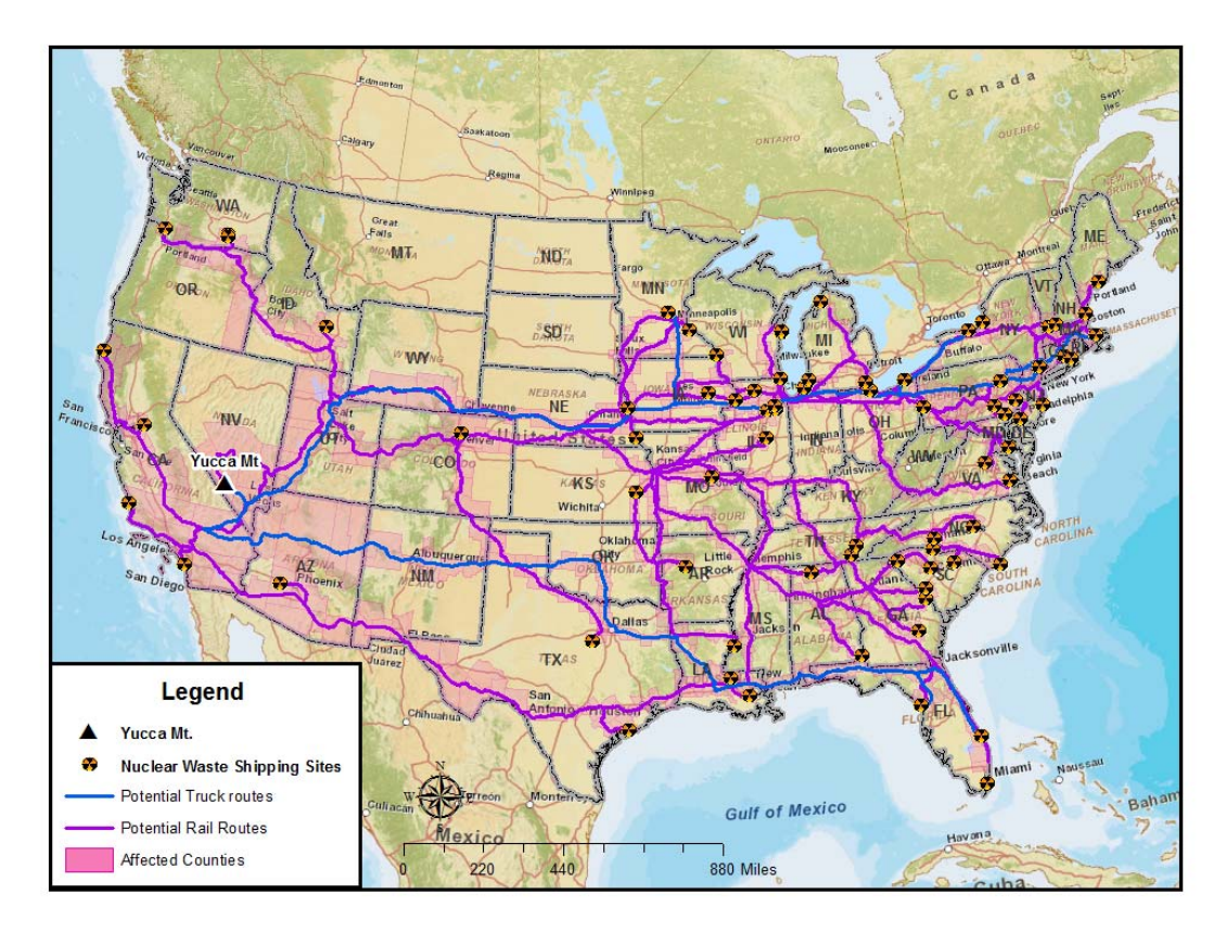
Fig.1. "Representative" Rail and Truck Routes to Yucca Mountain (DOE, 2008)

Shipments to a national repository or centralized storage facility would impact an extraordinary number of people, communities, and political jurisdictions. There are currently 76 storage sites in 34 states. The "representative routes" identified by DOE, from these sites to Yucca Mountain (see Figure 1), would have traveled 22,000 miles of railways and 7,000 miles of highways, traversing 44 states, the District of Columbia, 33 Indian nations, and about 836 counties with a population of about 161 million. (2005 Census estimates) Between 10 and 12 million people live within one-half mile (800 meters) of these rail and highway routes. And these routes would have affected most of the nation's congressional districts (330 in the 110th Congress). [18, 31, 32]