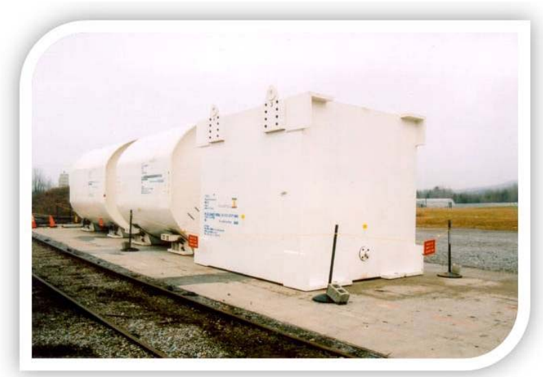
Fig. 2. Three large vessels removed from the Vitrification Facility in 2004 await shipment off-site following a WIR determination.

As a result of the lawsuit, DOE worked with Congress to develop criteria for making WIR determinations by the evaluation process. The legislation is contained in the Ronald Reagan National Defense Authorization Act, Section 3116 [7] which, although written specifically for