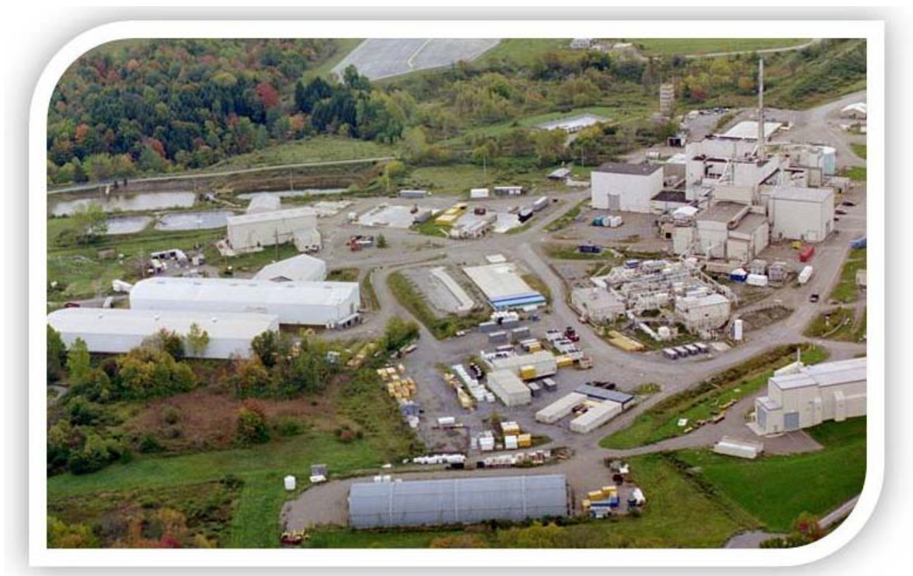
Fig. 1. At its peak, the Project had nearly 28,300 \text{ m}^3 of legacy waste in storage in tent-like structures and hardstands awaiting off-site disposal.

Since DOE's arrival on-site in 1982, emphasis has been put into the D&D of the facilities used for the SNF reprocessing operations. The focus was first on preparation of space to support the HLW vitrification operations and then later on cleaning the facilities used during vitrification of the HLW, as well as preparing the project facilities for eventual closure. Wastes generated during early D&D efforts were disposed of on-site in the disposal facility mentioned above. In1986, on-site waste disposal operations ceased and all subsequent Project wastes were placed into on-site storage for eventual off-site disposal. At its peak, the Project had nearly 28,300 m<sup>3</sup> of legacy waste in storage (Fig. 1). After vitrification operations were concluded in 2002, the Project was able to focus attention and resources on waste management.