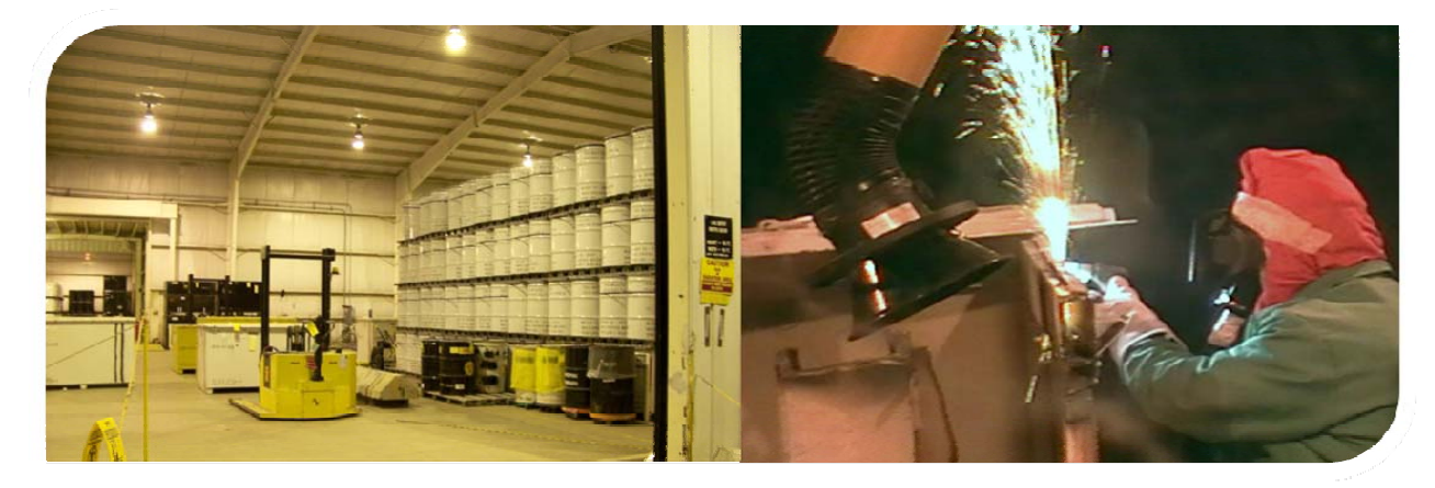
Fig. 3. RH and CH TRU waste processing (right) ramped up over the past four years. Once processed per the WIPP waste acceptance criteria, the TRU waste is placed in on-site storage for eventual disposition (left).

The lack of a clear disposal pathway has resulted in multiple handling of the Project's TRU waste. Over the past 8 – 10 years, West Valley has been processing and/or repackaging TRU waste inventory (Fig. 3) per the evolving WIPP Waste Acceptance Criteria (WAC) [9]. In 2009, the Contact Handled (CH) Transuranic Packaging Instructions [10] were issued and WVDP has implemented this guidance. This required the Project to process waste that had been already been packaged to the new set of criteria adding both cost and risk.