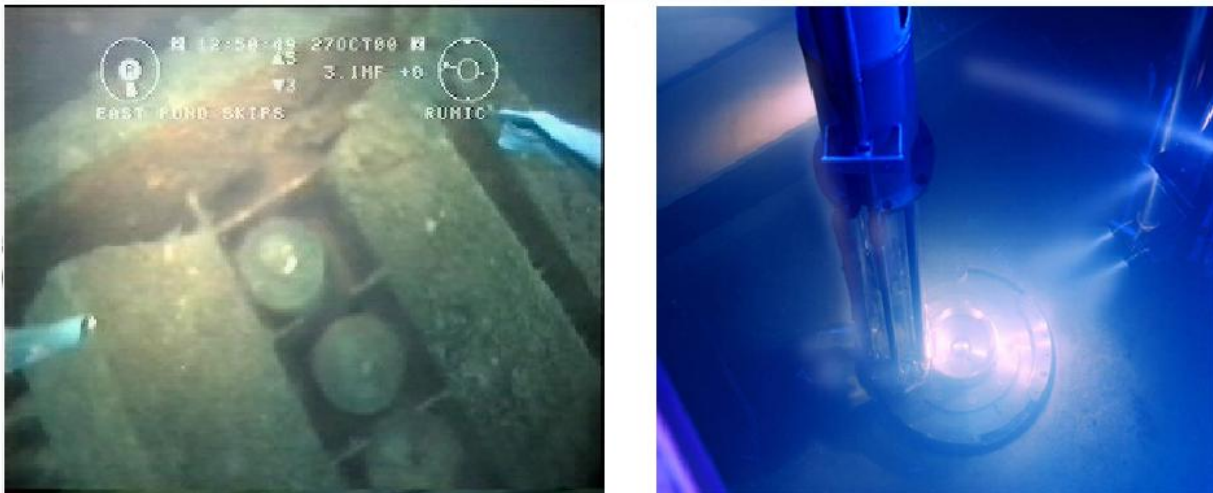
Fig.5. Canned fuel as stored in the pond and retrieval tool during works test

The Canned Fuel Project was initiated to establish a waste route for the fuel. This project has provided retrievals and export equipment, figure 5, within the pond to allow the fuel to be retrieved from the pond skips and placed into a new fuel flask. Using the new fuel flask the fuel can be transferred to an existing fuel handling facility which has been modified by the project to re-can the fuel in packages suitable for handling at THORP. All of the infrastructure required to export the fuel is now in place and inactively commissioned. The programme is waiting a suitable operational window in the downstream plant to export the fuel.