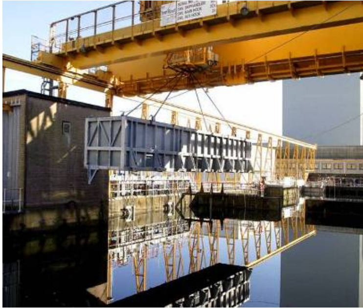
Fig 7 Corral installation

Transferring retrieved sludge to an in pond corral provides two benefits. It divorces the sludge retrieval programme from the provision of the storage plant, the corral also has a function in reducing the size and complexity of that plant by concentrating sludge, allowing transfer at a higher average solids content.