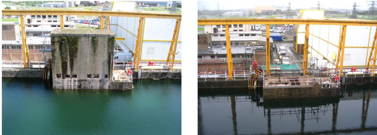
Fig. 3 East Winch House before and after demolition

the winch house used to stand has been transformed into a general purpose work and decontamination area where items removed from the pond can be worked on. To the North of the pond a redundant change room and office building were demolished, opening up access for the project work and freeing space for construction of new facilities.