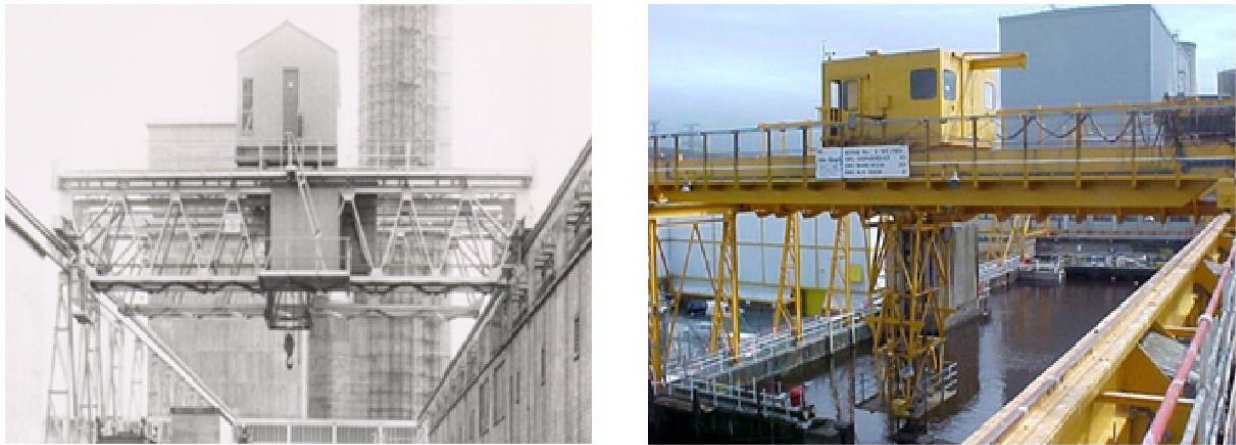
Fig. 2 Pile Fuel Storage Pond Skip Handler before and after replacement

A series of building refurbishment projects were initiated, with the first priority being the replacement of the skip handler, which had not operated since 1972. The skip handler is essential to operations, as it not only enables skips to be moved in the pond, but provides general lifting capability above the pond and provides the only operator access over the pond. The first project completed replaced the original skip handler with a modern system capable not only of moving skips but also providing a general lifting capacity of up to 20t over the pond, this was essential to enable future works. In addition to this work hydraulic isolation barriers were installed to separate the pond from the ducts through which fuel was originally transferred under water from the Windscale Piles. Installation of these barriers considerably simplified interactions within the pond as it enabled the pond to be considered as an independent water retaining structure.