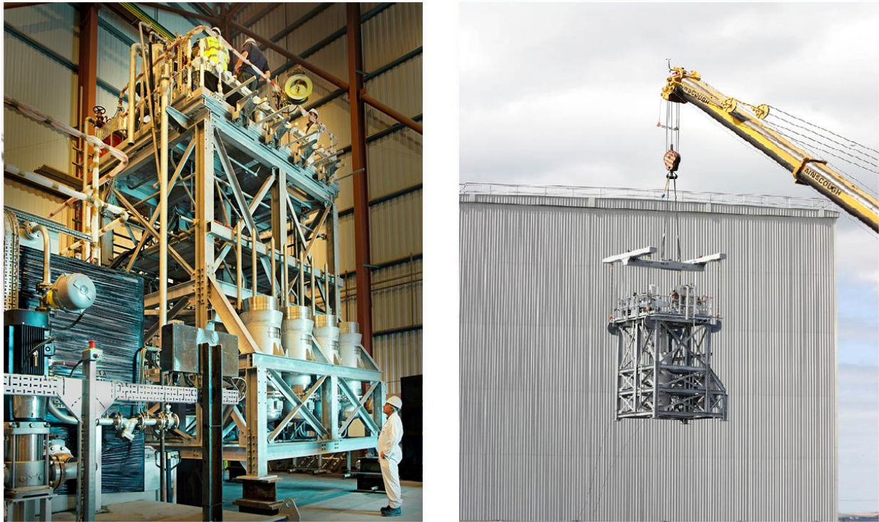
Fig. 4. LETP Module undergoing works testing and installation

required to lift the LETP over the Pile Fuel Storage Pond crane gantry, the lift required one of the largest mobile cranes in Europe, with a capacity of 800 t and use of a 60m long boom.