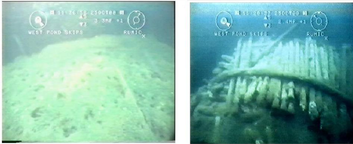
Fig.08. Video survey of a fuel cladding and isotope skip

The baseline strategy for dealing with this waste is to export it to a new purpose build ponds solids treatment plant, which is to be built on the site, where it will be encapsulated in cement along with waste from other Site facilities.