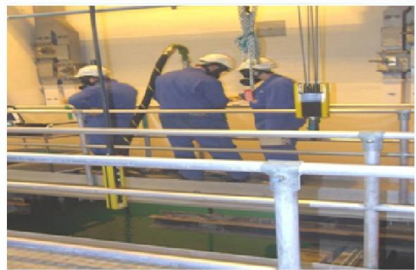
Fig. 6. Bay desludging operations