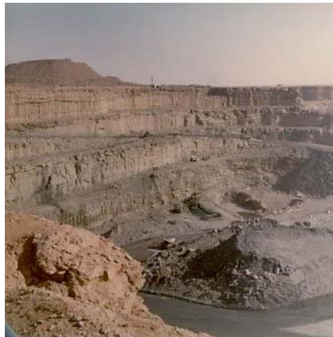
Uranium mine in France

open-cast mines, sometimes with an additional dyke, or in pools with a surrounding dyke, or behind a dyke damming a thalweg.