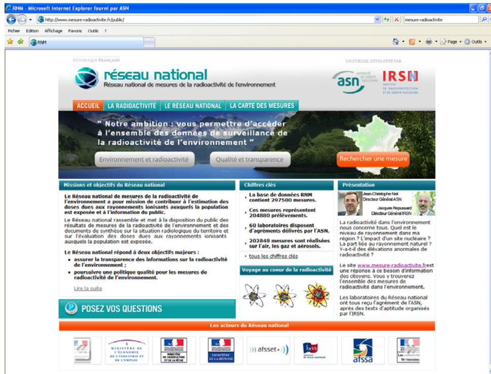
The national network website