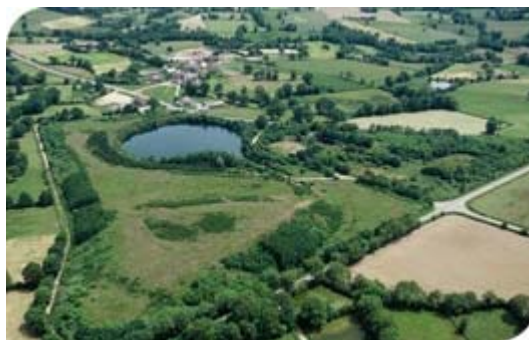
Mining site in Limousin (France)

The processing residues can be divided into two categories, with different specific activity levels: