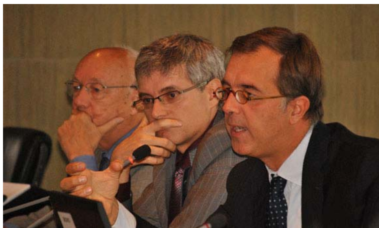
Press conference on September 17 2010