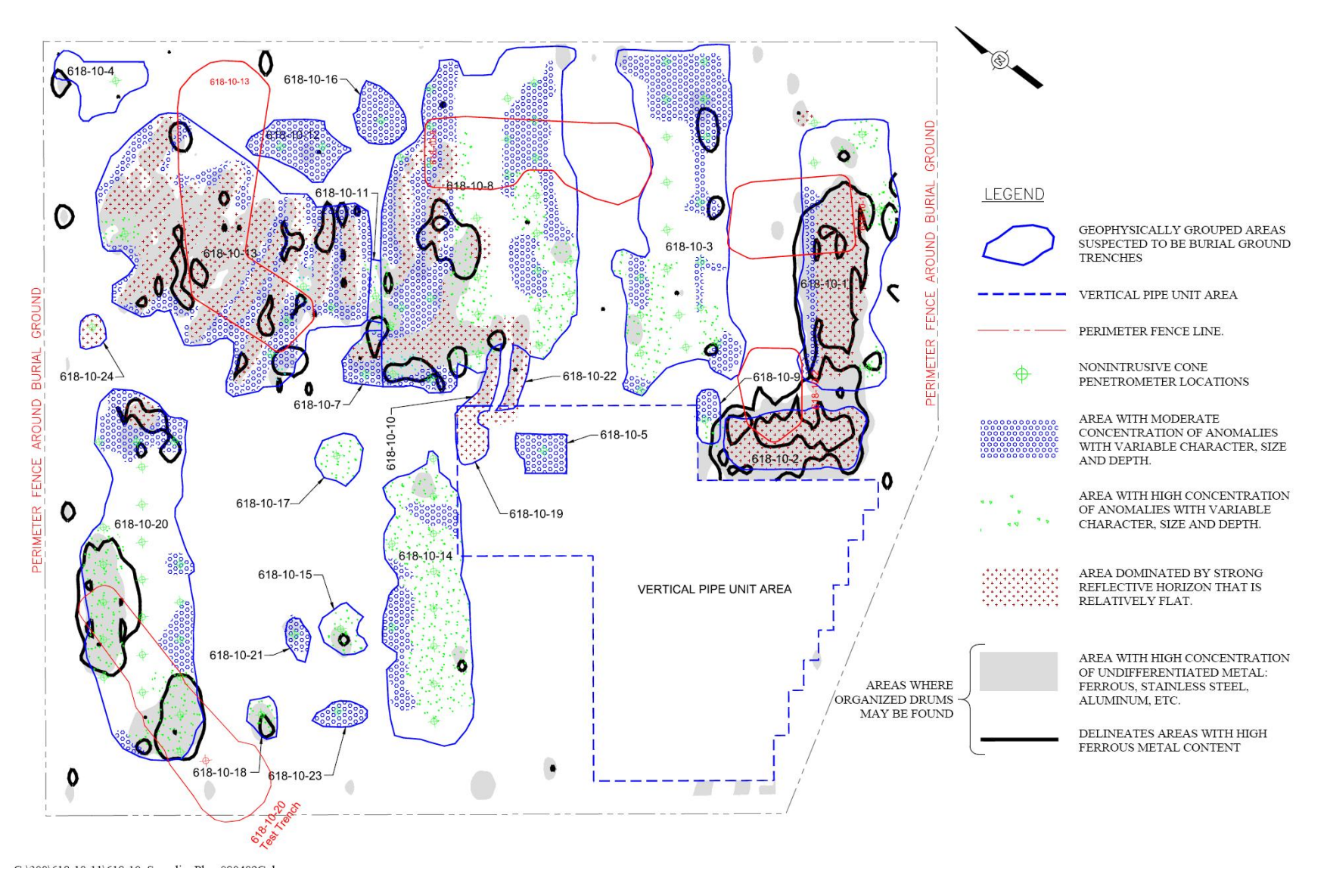
Figure 1. Map of the 618-10 Burial Ground Geophysical Analyses