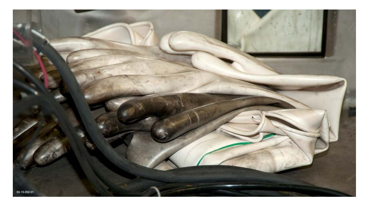
Figure 1. Recently Replace Glovebox Gloves

• RCRA Issues Leaded gloves are hazardous waste when discarded, and mixed-waste is created when this material becomes contaminated with radioactive material. Thus, discarded but not yet disposed of leaded gloves represent a RCRA liability, as shown in Figure 1 [4].