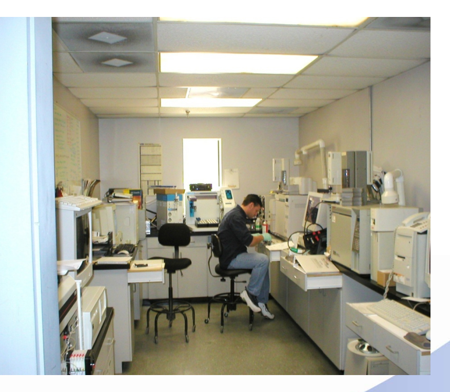
Research & Development