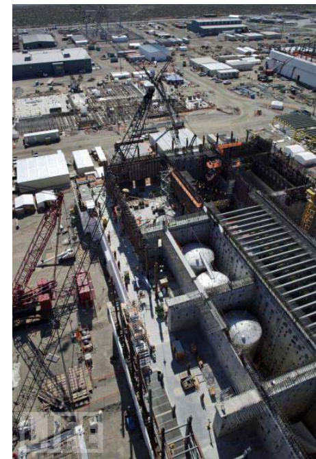
Waste Treatment Plant