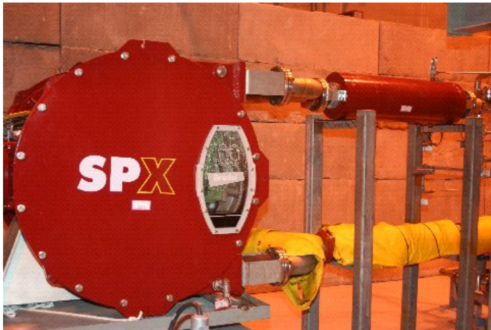
Figure 2: Saltstone Grout Pump

The 90% reduction in holdup volume between the mixer and pumping system had serious consequences on the performance and reliability potential for the original centrifugal pumps. Given the constraints of the smaller volume, it was essential to specify a pump that has low suction head requirements, self-lubrication, and a history of proven reliability. The project selected a Watson Marlow SPX-100 pump, which is a dual-head peristaltic pump capable of delivering over 11 L/s (185 gpm) of throughput under a wide variety of operating conditions. The pump, shown in Fig. 2, is of robust construction and is routinely used in industry for the transport of heavy slurries.