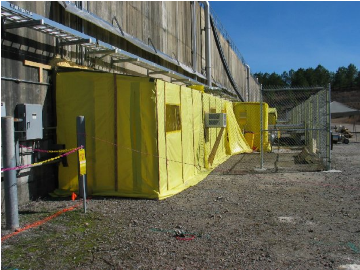
Figure 4: Radiological control hut and rain deflector installed to mitigate wet spots on Vault wall.

A series of Radiological Control hut and collection troughs were installed at Vault 4 for this purpose. A typical installation is shown in Figure 4.