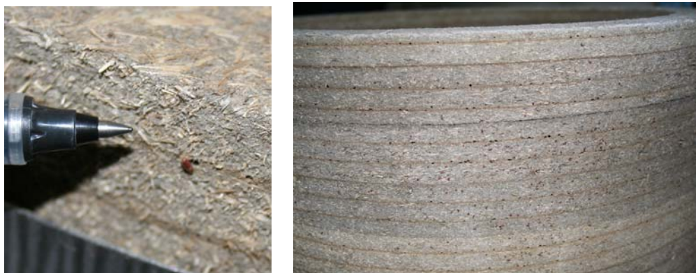
Figure 2. A Drugstore Beetle on the Celotex™ Assembly (an ink pen is at the left for reference) and Drugstore Beetle bore holes in the Celotex™ Lower Subassembly.

There were numerous beetle bore holes seen on the sides of the upper Celotex™ subassembly and on the internal face of the lower Celotex™ subassembly. It was discovered that there was a concentration of bore holes at the glue layers bonding the layers of Celotex™. The lower Celotex™ assembly contained numerous bore holes on the exterior of the assembly and there was a large amount of frass (beetle excrement) left inside the package. There was no evidence of any live beetles within the package or the Celotex™.