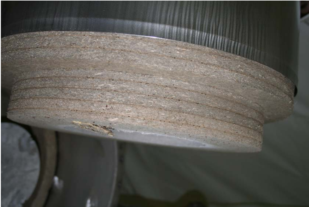
Figure 4. A photograph of the 02711 Upper Celotex™ Assembly taken 06/09.

The Celotex™ Assembly had similar damage and did not look to be any worse than before. A piece of Celotex™ was attached to the top of the upper assembly, but it was not evident which part of the package the piece came from. There was not any significant accumulation of frass on top of the upper assembly. There was no additional accumulation of lead carbonate and the amount of dead beetles did not appear to increase significantly since the last opening.