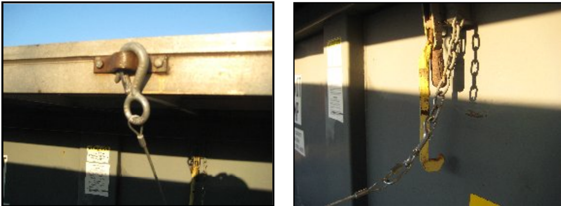
Fig.3. Showing lanyard connected to lid and container

allowing the other person to tighten the lid track binders. This secured the lid from further horizontal movement and allowed for the safe pivoting of the lid to the fully opened position.