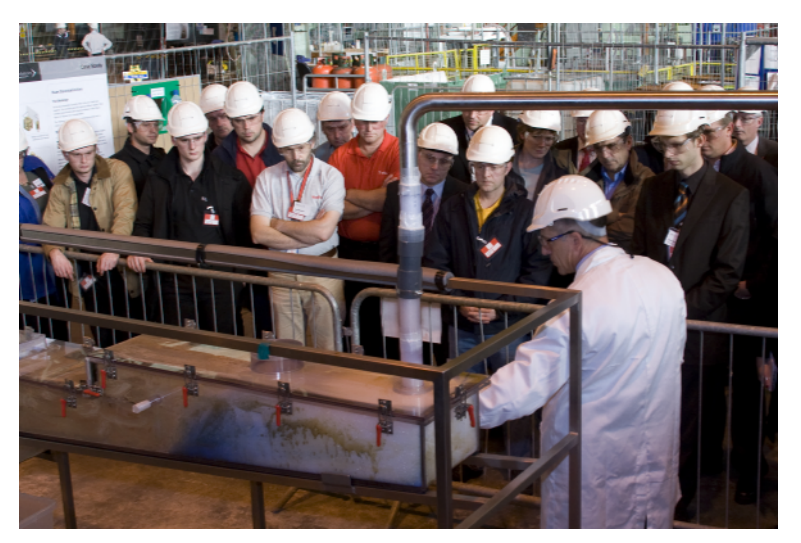
Figure 3 Foam Decontamination Trial

One recent example has been the development of a foam decontamination process (Figure 3). This approach aims to provide a deployment method for aqueous decontamination reagents, whilst reducing the volume of liquid required for deployment and subsequently reducing the amount of secondary liquid waste.