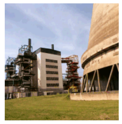
Figure 1 Magnox Reactor

The UK has had a long history in the nuclear industry and was the first country to introduce commercial nuclear power. The first Magnox Reactors opened at Calder Hall in Cumbria in 1956, and the most recent Pressurised Water Reactor started generation in 1995. Whilst most of the UK Magnox reactors (Figure 1) have now shutdown after long operating lifetimes, two remain in operation today at Oldbury and Wylfa. However, electricity continues to be generated by nuclear power stations, with a fleet of Advanced Gas Cooled Reactors (AGRs) and one Pressurised Water Reactor operated by British Energy.