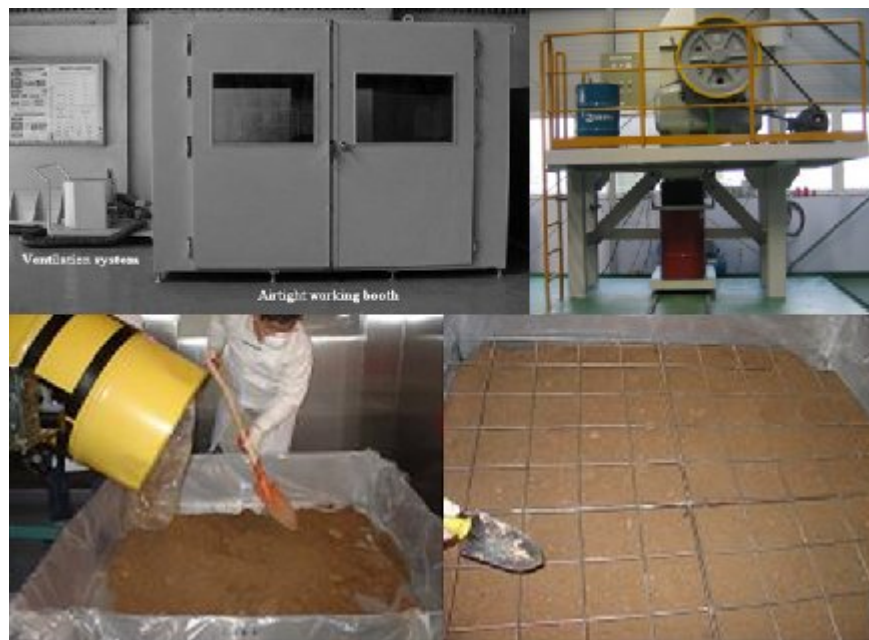
Fig. 2. Equipment and tools for the regulatory clearance

Finally, for handling a heavy drum or a tray with waste, a fork lift and a drum lift were used. As those were for use in the working booth, some parts were modified to fit in the working booth. The equipment and tools are showed in Fig. 2.