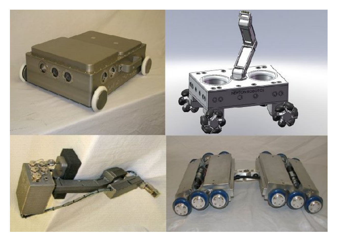
Fig. 4. Examples of robots designed for specific purposes: Clockwise from the upper left: Surveyor data gathering robot; Concrete Removal robot using high pressure water jets; Bridge and Sign inspection robot; Valve Seat inspection robot for hazardous areas

A specific example of this unity of purpose can be found in the robot teams designed to clean, strip and recoat the torus shown in Figure 3. Each team consists of general surface preparation robots using both mechanical and laser ablation to strip the old coating coupled with machine vision to determine if the coating is fully removed. Pipe OD and ID surface preparation robots also use both mechanical and laser ablation to strip the old coating and machine vision for quality control but are able to effectively navigate curved surfaces with a variety of radiuses. A self-movable Robot platform equipped with a six axis arm with multiple heads will prepare all areas not accessible to the main surface preparation robot.