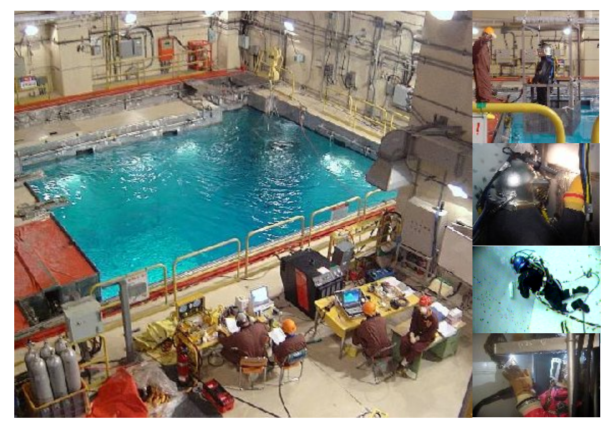
Fig. 1. Typical diving operation. Clockwise from left: dive control station, diver entering fuel pool, diver inspector, diver applying fixative, and diver welding.

Radiological diving procedures specific to the types of environments present at D&D sites are designed to prevent skin contaminations, reduce dose, and ensure safe and efficient work evolutions. Divers are fully encapsulated in heavy-duty dry suits with an attached supplied-air helmet. A constant positive pressure is maintained to prevent leakage. Divers are in continuous hard-wire radio communication with surface support personnel. Helmet mounted cameras 'see' what the diver sees and transmit live vide images to a video monitor at the dive control station.