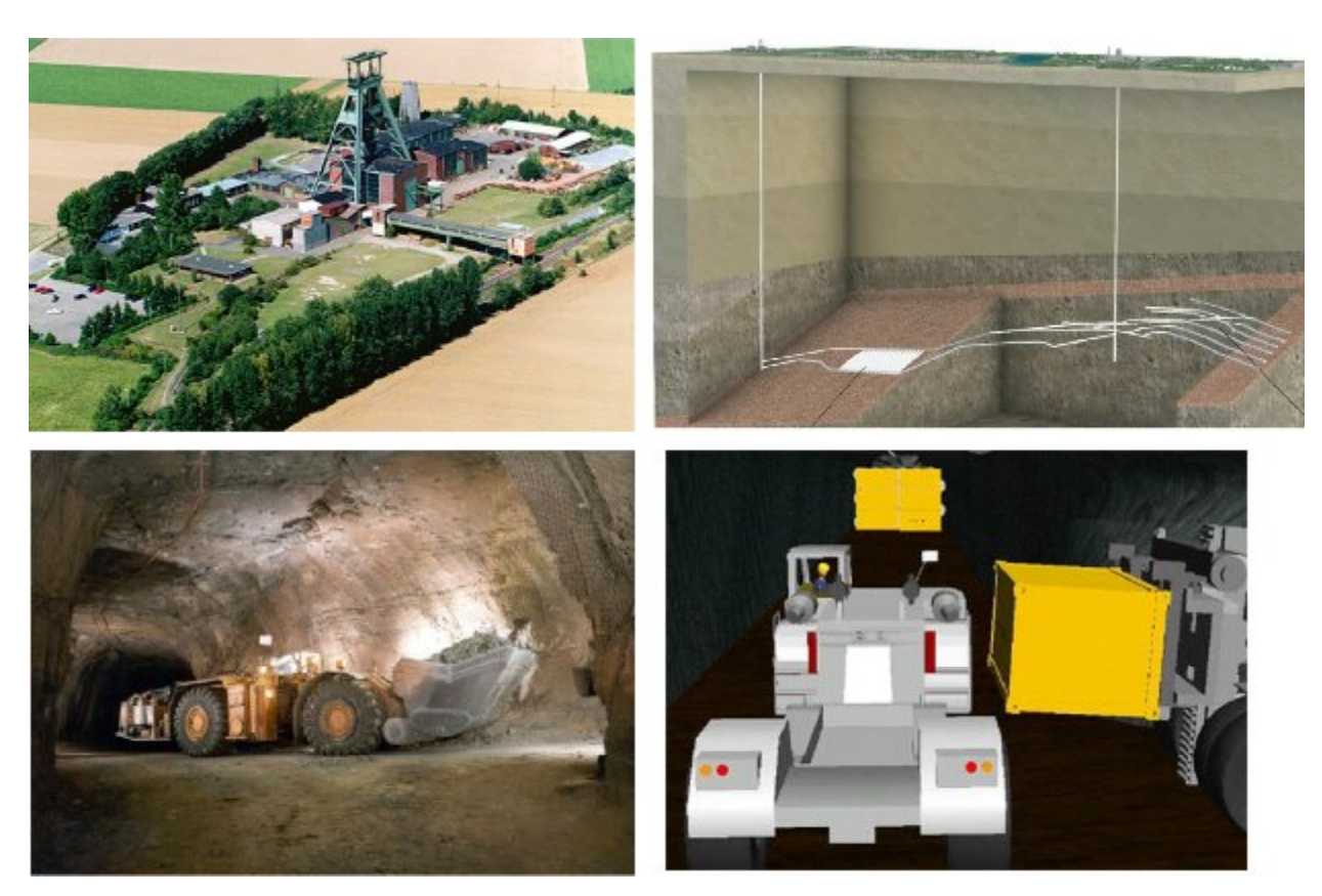
Fig. 1. The Konrad repository (top left: aerial view, top right: geological situation, bottom left: under ground, bottom right: container handling animation).

The Konrad repository (Fig. 1) is now en route to start operation in 2014. It represents a deep, geologically stable, repository as a solution for the safe, maintenance-free, and permanent storage of radioactive waste. Future generations should not be confronted with the responsibility for managing a legacy of deposited waste or bringing such waste back to the light of day for other means of disposal. Further details are described in a BfS brochure [4]. The licensed capacity of this repository is 303.000 m³, old containers from earlier fabrication as well as new containers of specified shape and dimension can be stored there. New containers are fabricated from the beginning according to the Konrad requirements and consequently controlled before starting the batch production and loading with radioactive waste. Old containers were manufactured before or during the preliminary discussion of the Konrad acceptance criteria with more or less lacks in specification or documentation quality which has to be evaluated with respect to the up to date container safety level.