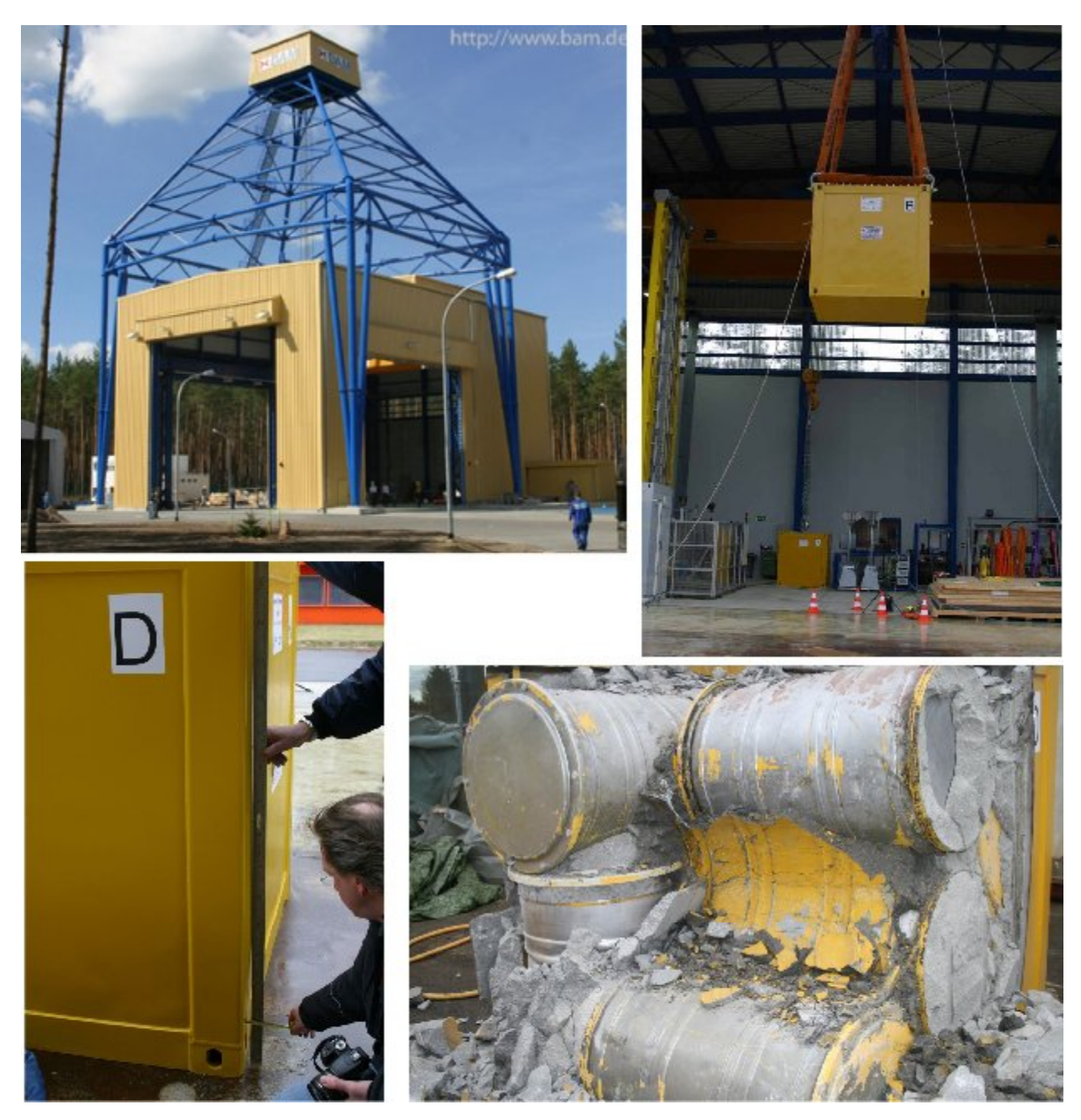
Fig. 2. 5 m drop test of a steel container Konrad Type II (ABK I with accident safe packaging) manufactured by Eisenwerk Bassum GmbH at the BAM drop test facility. Left bottom picture shows minor plastic deformation without loss of integrity after the test. Right bottom picture shows investigation of 200 liter drum condition.

finally certified in 1999. Up to now, BAM is involved in quality assurance procedures, especially with respect to the material quality and ultrasonic inspection. Another example is a cylindrical concrete container of the Konrad Type II with an outer steel liner, fabricated by GNS, too, which has been certified in 2007.