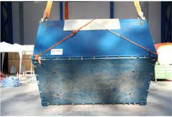
Fig. 4. Steel container Konrad Type V (old) including 26 charged 200 liter drums fixed with concrete; ABK I; drop test: 80 cm height.