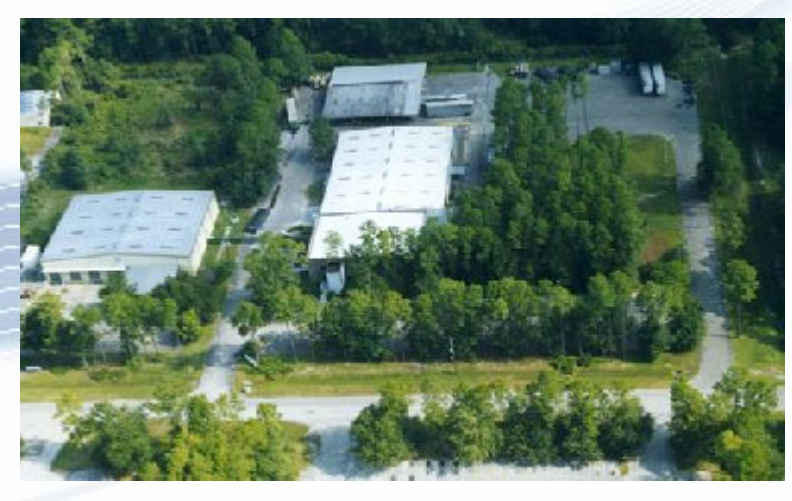
PFF Gainesville, FL