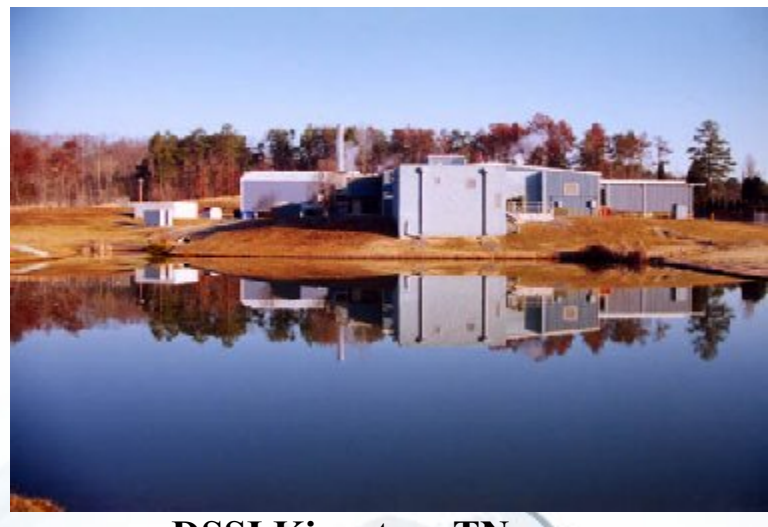
DSSI Kingston, TN