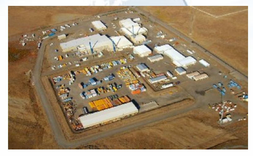
PFNW Richland, WA