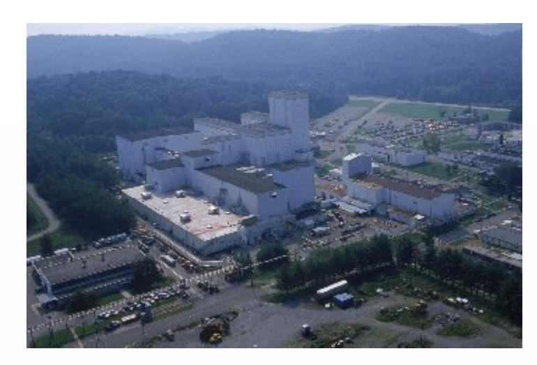
M&EC Oak Ridge, TN