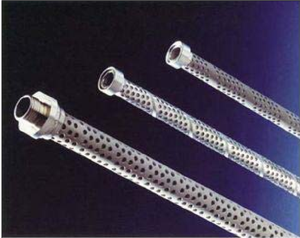
Fig 2. Typical, fabricated high permeability crossflow tubes with various end connections.

Microfiltrex low permeability crossflow tubes not only have a permeability some tens of times higher than the typically used (especially sintered powder) tubes, but, as they are fabricated and not pressed in moulds, can be produced in diameters as low as 9 mm (3/8"). This is important as crossflow filters depend for their efficiency on the velocity at which the solids are carried around the system. The velocity in the tubes must be high enough that the largest particles are held in suspension (so that, by definition, the smallest particles – the normal challenge in filtration – are also held in suspension) and do not challenge the filtration media. For the same number of filter tubes of the same permeability, the smaller diameter reduces the rate at which the fluid must be pumped round system, reducing energy costs.