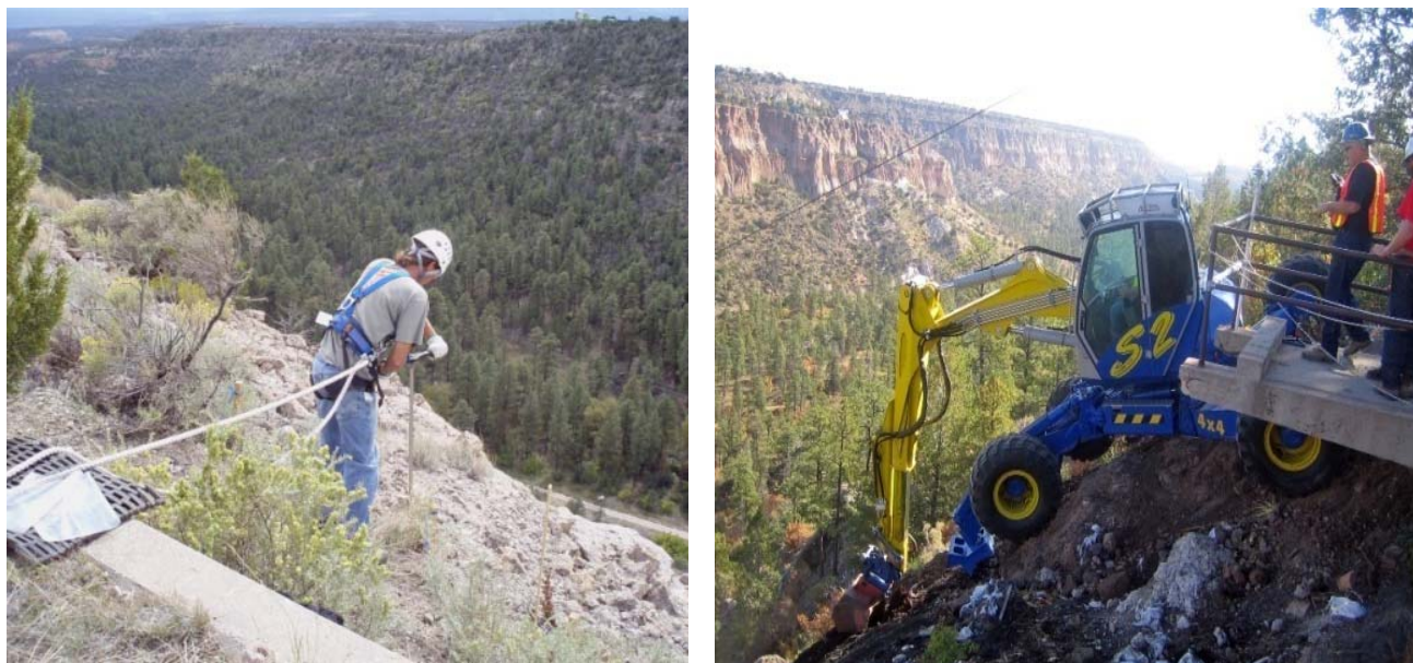
Figure 2. LANL's topography and historical disposal practices complicate characterization and cleanup.

Although not necessarily unique, the subsurface geology at LANL is some of the more complex of the DOE installations across the US. As further described in a separate paper and illustrated later in Figure 4, LANL is underlain by a number of different formations within the first 2000 feet below ground surface, principally volcanic in origin, each with significantly different hydrologic characteristics, and many that are discontinuous and highly fractured. This complicates drilling activities, as well as modeling and analyses. Levels of contaminants in the intermediate and regional aquifers can be significant in some locations and not detected just a short distance away.