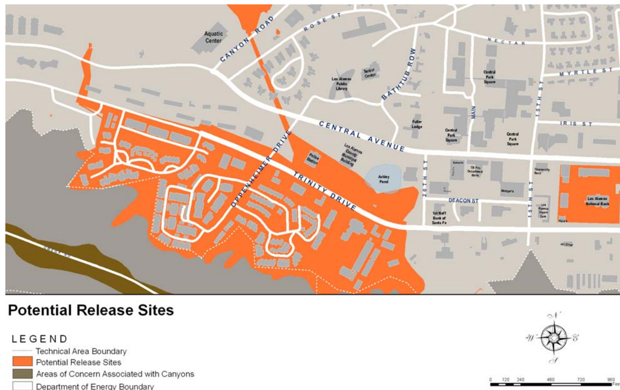
Figure 3. Major investigations are underway in downtown Los Alamos.

Residences in the community of White Rock are just to the east of LANL’s primary waste storage and disposal facility at TA-54. The closest are just over a mile from the eastern-most transuranic waste storage and processing facilities. The proximity of the public and the dispersible nature of the waste form led the Defense Nuclear Facilities Safety Board and DOE to designate several hundred drums of high-activity transuranic waste as one of LANL’s highest risks after the Cerro Grande fire in 2000. While less than 1% of the aboveground inventory of waste in storage, the high-activity drums were nearly one-third of the total curie inventory in storage. As described later in this session, expedited efforts were made to modify facilities to enable processing of this waste under Hazard Category II requirements, to open and repackage more than 160 of the waste containers, and to complete full characterization and certification before shipment to WIPP.