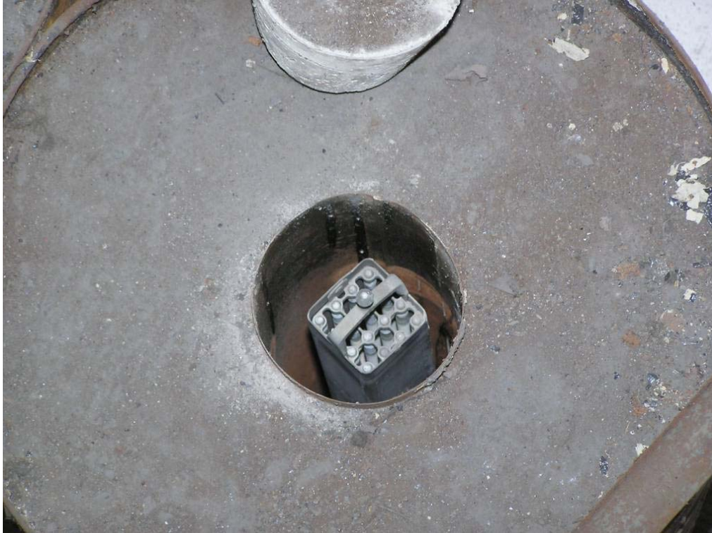
Fig. 1. View inside one EK-10 storage drum after plug removal.

A new hot cell was built in HLWSF, and EK-10 SNF was repacked between the years 2006 and 2007 into stainless steel canisters, hermetically welded, put into a cask basket and then stored in a storage facility located close to the hot cell. Additionally, some leaked IRT-2M FAs were also repacked. Most of the IRT-2M SNF was moved out of the initial AFR pool in the reactor building into the HLWSF pool between the years 1996 – 2003. A ŠKODA 1xIRTM transport cask was used for each FA.