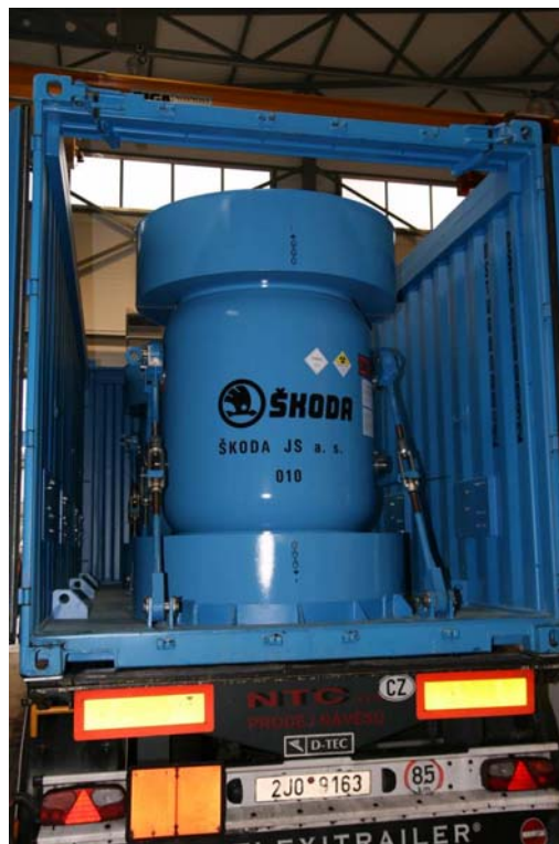
Fig. 4. ISO container with the VPVR/M cask.

Before transport, the transportation documentation had to be prepared and assembled and all necessary transport licenses had to be acquired. The transport of SNF from the Czech Republic to the RF took place across the transit countries of Slovakia and Ukraine by combined rail and road transport. The transport was performed in December 2007. The VPVR/M casks were loaded from the HLWFS storage area into the ISO containers (see Fig. 4). The ISO containers were transported to the railroad station on trucks and were then transferred onto the railroad carriages. Physical protection and emergency preparedness were ensured during transport.