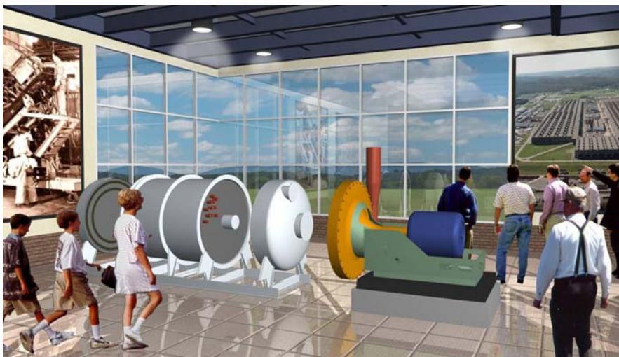
Fig. 4. Artist's conception of a converter display for a museum commemorating the K-25 plant.

To support DOE's decision-making regarding the K-25 building preservationists have proposed and estimated the costs of various options for retaining a small portion of the structure or interpreting the site by other means. Plans include retaining a demonstration cell to explain the gaseous diffusion process, creating museum space to display various artifacts (Fig. 4), and construction of a tower to view the footprint of the building, which is to be marked to delineate its height and extent.