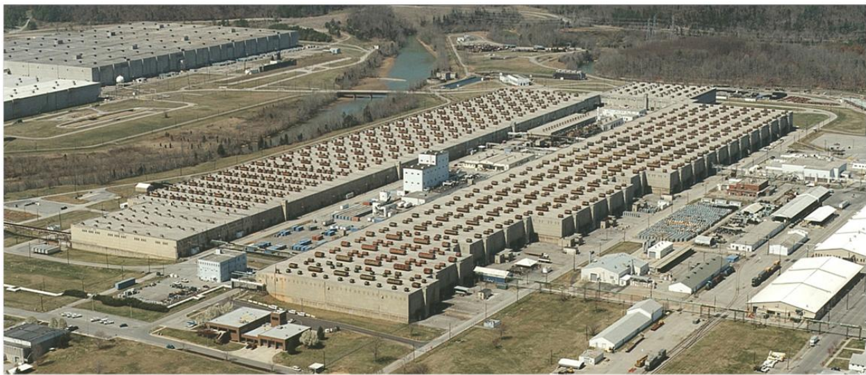
Fig. 2. The U-shaped K-25 Gaseous Diffusion Plant and supporting facilities.

The 6.1-km 2 (1,500-acre) K-25 site is located 16 km (10 miles) west of today's downtown Oak Ridge. Constructed in a mere 18 months from 1943-1945, the 1.6-km (mile-long) U-shaped K-25 building (Fig. 2) enriched a minor amount of the uranium used in the first atomic bomb. The K-25 plant produced enriched uranium using the gaseous diffusion process, which separates molecules of a lighter isotope from those of a heavier one by use of a porous barrier [1]. The bulk of its post-WWII production of highly enriched uranium, 490 metric tons, was in support of the Cold War. In 1964 the K-25 site ceased producing weapons-grade uranium and transitioned to production of low-enriched uranium for peacetime civilian reactors. Enriched uranium production in Oak Ridge ceased in 1985.