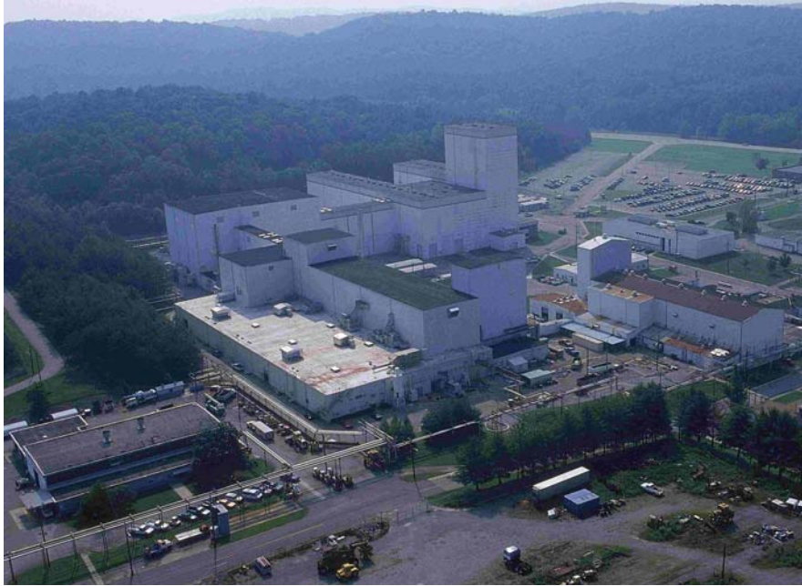
Fig. 3. The former experimental centrifuge building complex that houses M&EC’s facilities at ETTP.

treatment as well as long-term contracts with industrial clients. Work being performed under the DOE contract for the K-1200 South Bay facility was classified at the “Secret Restricted” level, requiring an active Q clearance and an established “need-to-know” for all project personnel and a DOE-approved security plan.