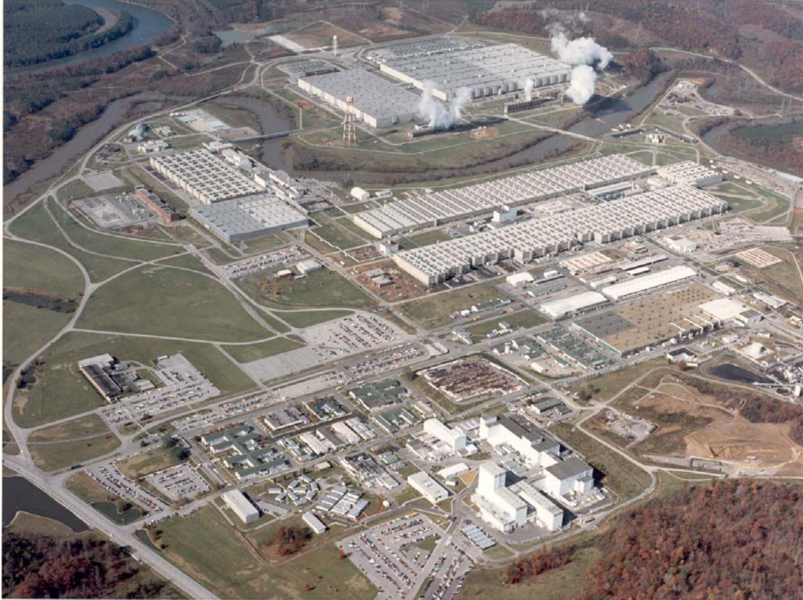
Fig. 1. East Tennessee Technology Park circa 1982.

and running, an astounding engineering achievement. The K-25 Building is recognized by the DOE as one of seven Manhattan Project Signature Facilities.