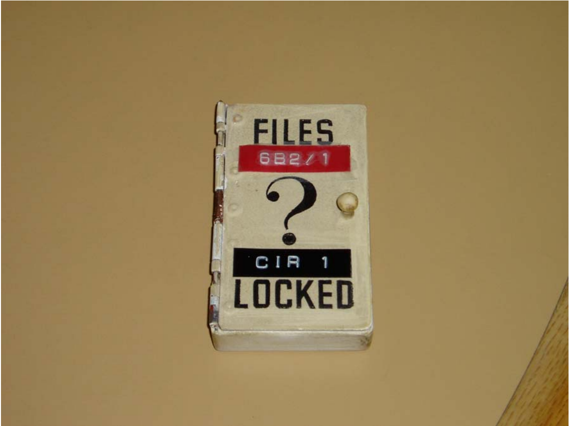
Fig. 4. Light switch with a reminder to secure files.