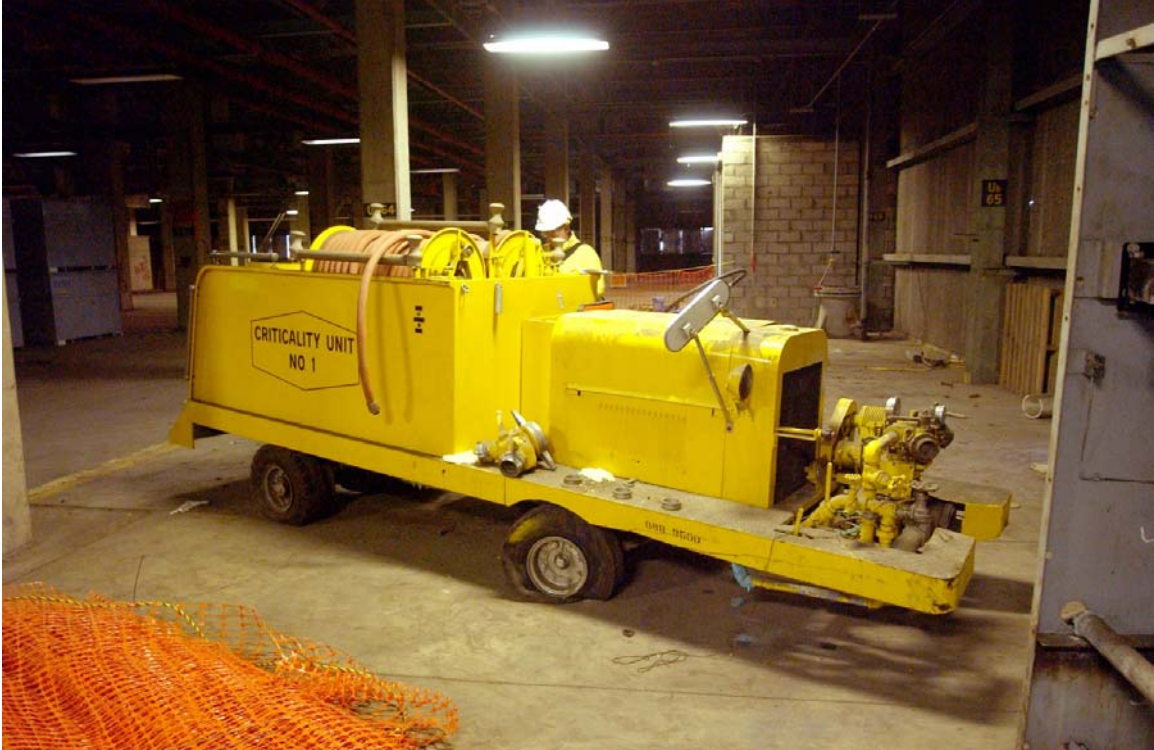
Fig. 3. Criticality response unit.