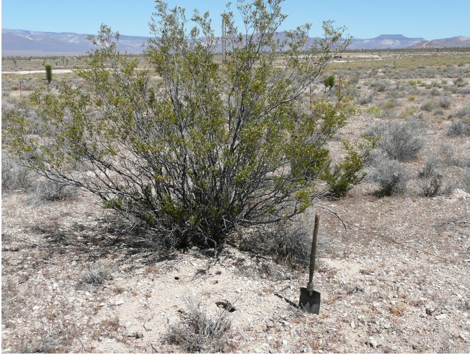
Fig. 2. Bioturbated shrub mound formed around a creosote bush ( Larrea tridentata ) on Yucca Flat on the Nevada Test Site. The photo was taken in June 2008.

categories included grass mounds, shrub mounds, and “complex mounds,” the last category being large mounds that formed around a group of shrubs of different species. The mounds vary in size. Gomes [9] measured shrub mounds as large as 3 meters (m) across and 0.30 m high in Plutonium Valley on the NTS. Those on the TTR are smaller, the largest being 2 m across and 0.20 m high, the smaller ones 0.3 m across and 0.05 m high [3].