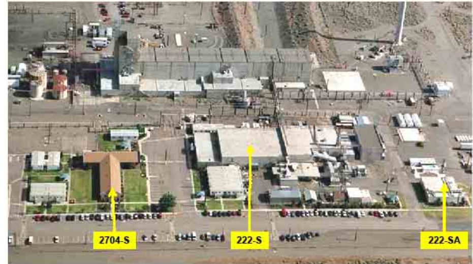
Buildings identified above are used by small business and shared with Tank Operations Contractor.