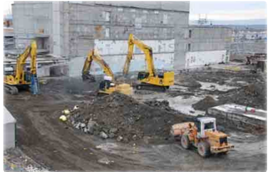
K East Reactor basin demolition