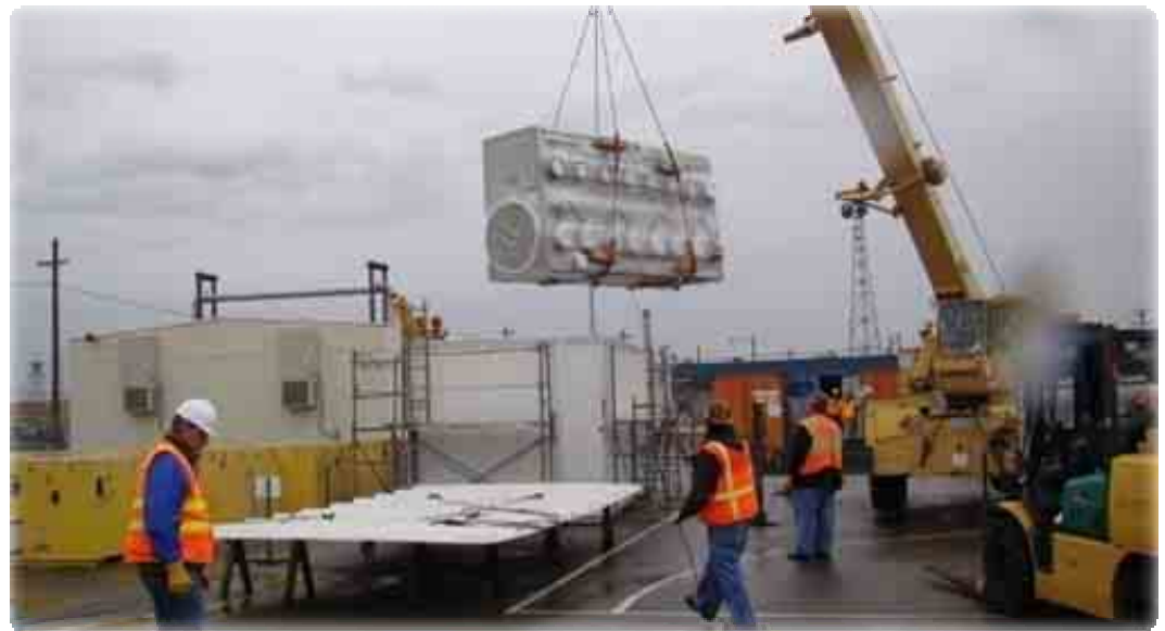
Glovebox removal from PFP