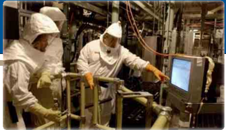
K West sludge pumping