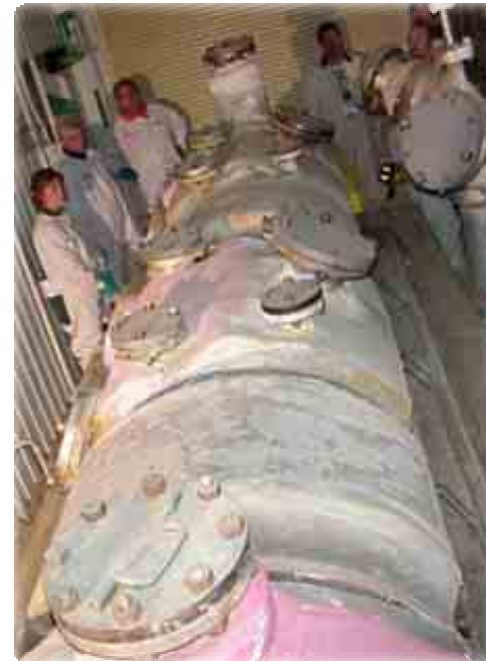
U Plant Ancillary Building asbestos removal