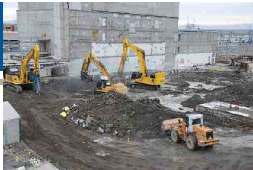
K East Reactor Basin Demolition

Project Mission: Decommissioning and remediating the Central Plateau, 100K Project, and site groundwater