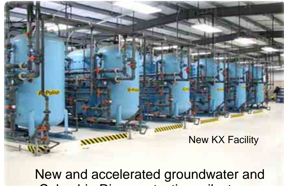
New KX Facility

New and accelerated groundwater and Columbia River protection milestones