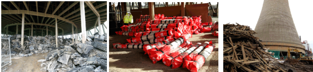
Segregation of internal packing materials prior to disposal

The towers were re-packed in 1978 and 1994. The total volume of material removed comprised 75 tons (1 mile) of asbestos piping, 6,000 m 3 plastic packing, and 260 tons of tanalised timbers from each tower.