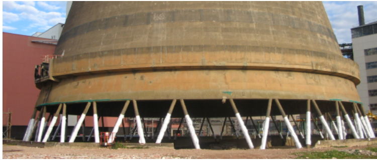
Primary protection in place on tower legs

To further protect against fault conditions, secondary protection was also provided where necessary to minimise the impact of AOP or fragmentation damage to essential facilities that may be susceptible to damage. This was detailed in the Plant Specific Assessments, however the demolition contractor retained ultimate control over the minimum required protection for adjacent facilities/plants. The protection details were then specified in the final detailed method statements and verified by an independent explosives expert.