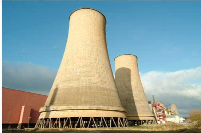
Calder Hall Cooling Towers

Each of the four cooling towers was approximately 88 meters (m) in height from the pond base and had a hyperbolic reinforced concrete shell. The minimum thickness of shell from the top down to approximately 29 m above the pond base was 114 mm. Below this level the thickness increased linearly to the bottom of the shell where it was 406 mm.