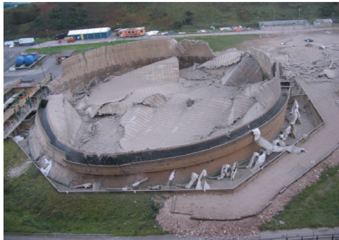
Tower debris prior to clean up work commencing

On demolition day itself, a 200 m exclusion zone was established, manned by 61 sentries, and final plant checks were carried out prior to the final explosive connections being made at the command post firing point. The demolition itself occurred in two phases; the north towers were demolished as a pair first, followed approximately four minutes later by the south pair of towers. This delay for visual checks was specifically scheduled into the PIP to ensure that there were no problems with the demolition method statement. Each pair of towers fell in less than 4 seconds, landing almost entirely within the confines of the tower basis as predicted. Debris spread was also confined to the immediate vicinity of the towers, well within the 10 – 20 m range identified by the technical notes underpinning the demolition.