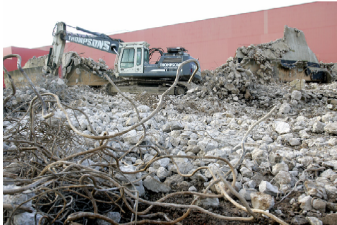
Clearance work underway on site

Once this is completed, with the south pair scheduled for completion in March 2008 and the north pair shortly after, the remainder of the voids will be filled with similar waste from other projects across the Sellafield site.