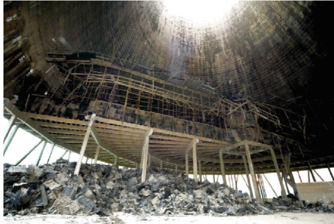
Towers showing various layers of internal structure

The tower internals consisted of concrete supporting columns and beams, timber framework supporting the plastic pack, and asbestos cement pipes.