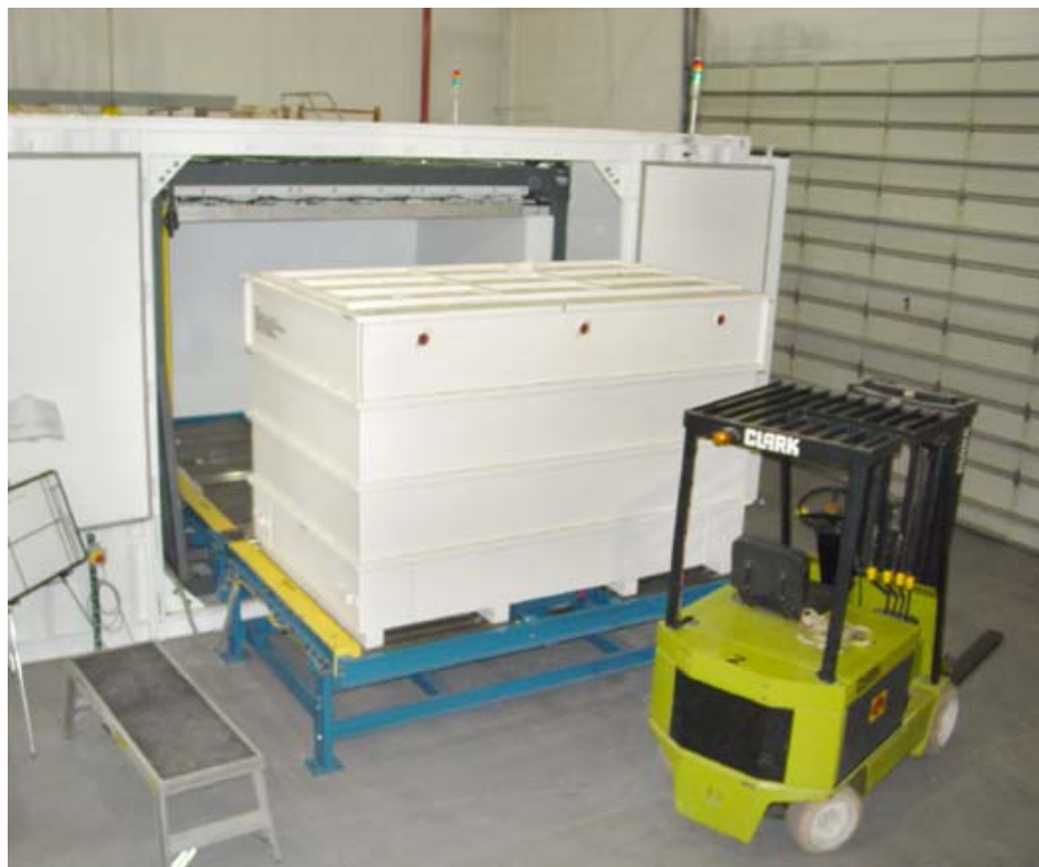
Fig. 4. BNAS general layout.

201cm tall (10' x 6.8' x 6.6' ) with the height being measured from the top of the conveyor, and so can accommodate an SLB-2 container comfortably. The internal height was set by the dimension of the TDOP container. In order to ensure that the container is centered in the assay cavity, guide bars are installed on the sides of the conveyor, and for the smaller containers a loading palette is used.