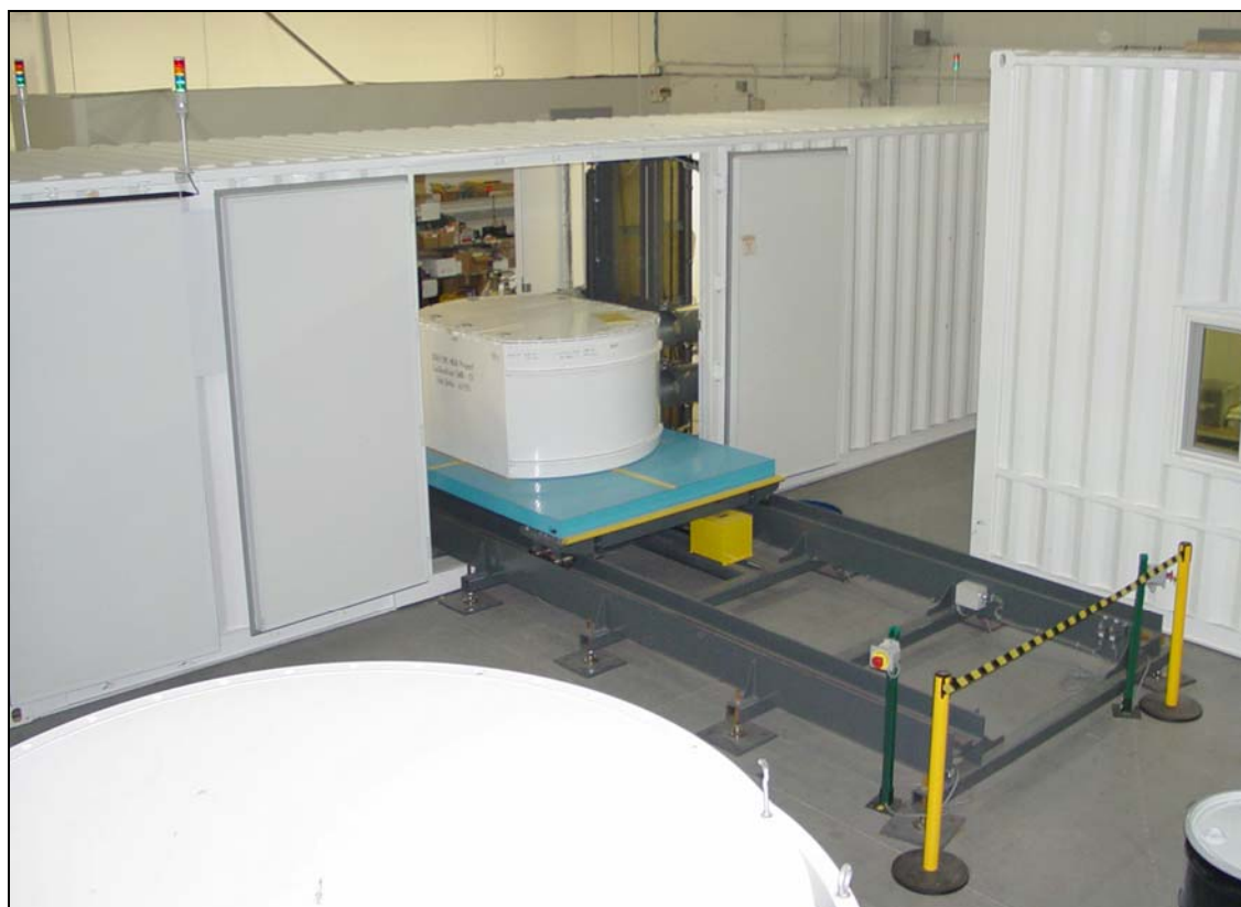
Fig. 2. BSGS assay of an SWB container

sized container, is a compromise between the size of the container, the time allotted for the total measurement, and the statistical precision desired at each measurement position. The container passes through two counting stations; a passive emission measurement takes place at one station, and a ^{60}\text{Co} transmission measurement takes place at the other, with the container stationary during each measurement. Figure 2 shows the BSGS in the process of assaying an SWB container.