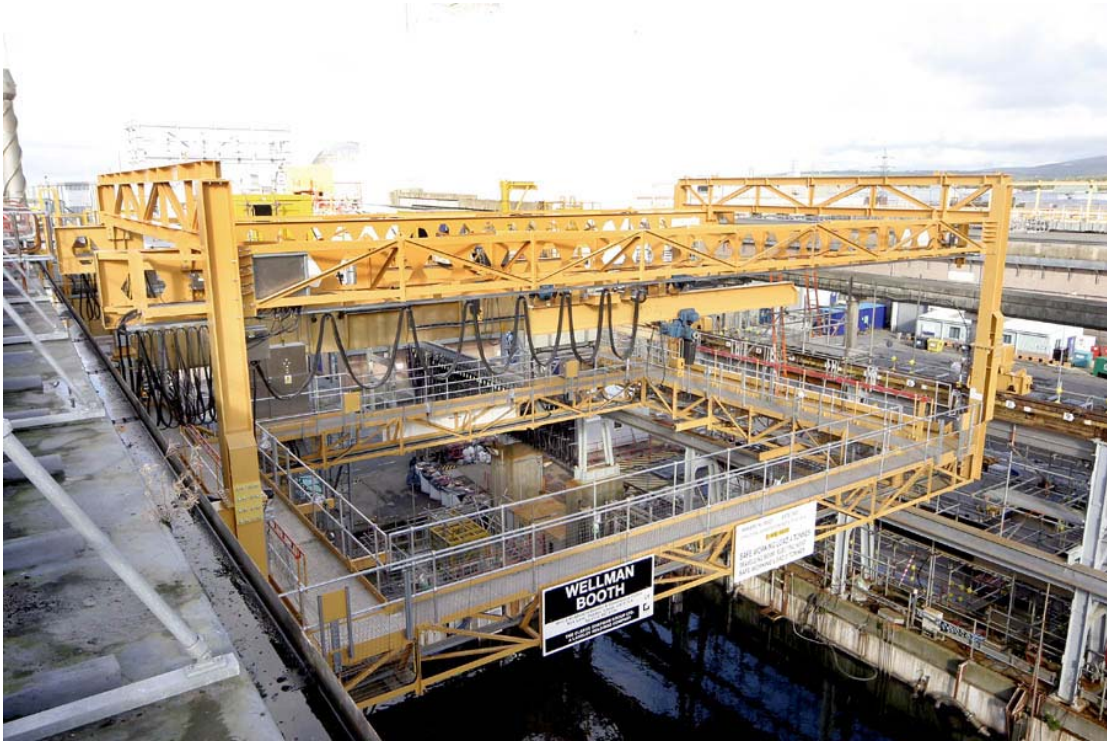
Fig. 4: GRS in position on the pond