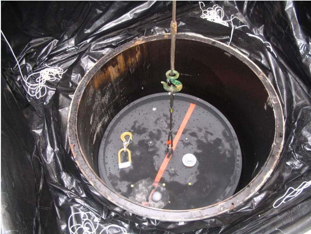
Figure 1 Resin Liner Being Directly Picked from an Open IC

Resin liner recovery tools were planned to be simple manually operated tools. Duratek's experience indicated that variations of the basic designs used in previous fuel pool work could be employed to engage the resin liners. This approach was followed to develop several different resin liner recovery tools for engaging various designs of lifting lugs and links that were expected to be encountered.