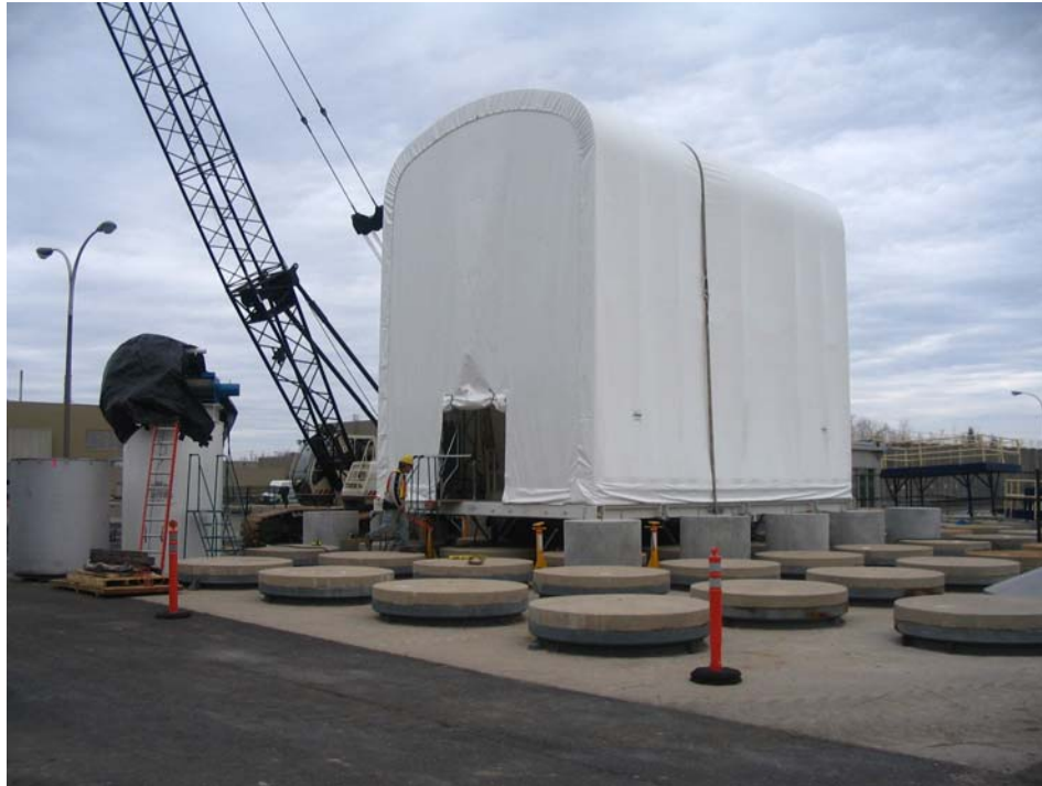
Figure 2 A View of the Construction Island Showing the Enclosed Work Platform, the Crawler Type Crane, the Over-Pack and IC-18s

Dose rate and gamma activity measurements required as part of the work scope were recorded in-situ by lowering radiological equipment down the 4-6 in sample pipe which runs along the full depth of the IC (the pipe connects to the IC at the bottom but otherwise is separated from the IC wall by several inches of concrete). In-situ measurements permitted a) dose rates at the surface of the stored liners to be projected prior to their lift, thus providing valuable information for planning the individual liner over-packing operations, and b) avoided the need for gamma activity measurements on the work platform following a resin liner lift, thus saving dose and process time.