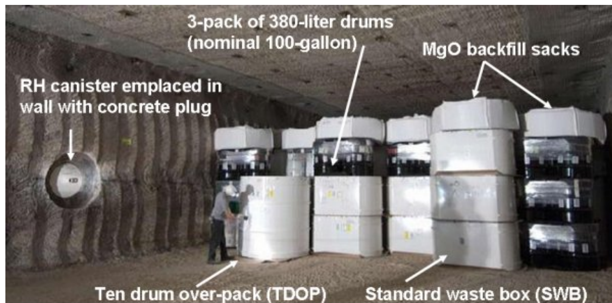
Figure 1. A previously emplaced RH waste canister has been inserted in the borehole in the wall at left, with a concrete plug in front to shield personnel working in the CH disposal room.

boreholes. The need to coordinate timing of RH emplacement with CH emplacement puts a significant strain on overall repository operations.