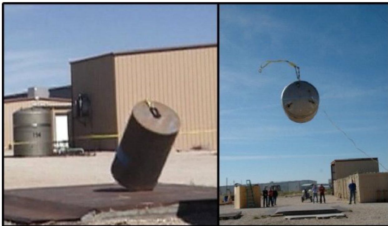
Figure 4. Drop testing the Shielded Container (left pane) and inside a shipping container (right pane).

The right pane of Figure 4 shows one of the 9-meter drop tests. Three fully loaded shielded container assemblies were placed inside the shock absorbing dunnage (shown in Figure 3), and the entire payload was then placed into the inner containment vessel of a HalfPACT shipping container for the drop test. The HalfPACT is a NRC licensed type B package that consists of an inner containment vessel and an outer containment vessel that is surrounded by shock absorbing and thermally insulating foam, which is itself surrounded by an additional protective shell. The SCA HAC drop test did not employ the outer containment assembly (i.e., outer containment vessel, foam, and additional protective shell) that would be present in a real accident, which made the test extremely conservative. The 9-meter drop test documented the ability of the shock absorbing dunnage to maintain the SCA shielding efficacy under NRC-required hypothetical accident conditions. The 9-meter drop test tested the ability of the dunnage to protect the shielding capability of the SCA, and was not intended to test the HalfPACT inner containment vessel, since the SCA and dunnage were designed within the licensed payload limits of the HalfPACT. After all cumulative drops, the shielded container test units suffered only minor, almost “cosmetic” damage.