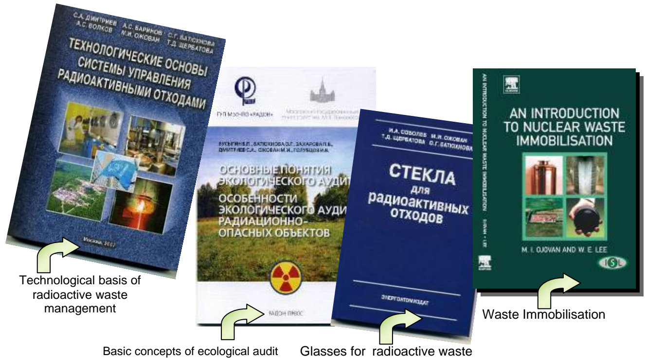
Fig.4. Published books by IETC specialists for trainees.

The efficiency of training at IETC was systematically analysed using the structural adaptation of educational process as well as assessing factors, which have influenced on education quality. Social-psychological aspects were also taken into account in assessing the overall training efficiency. Based on its efficient training one of the main tasks of IETC became preparation of textbooks, technical manuals and guidance documents for trainees in collaboration with colleagues from Nuclear Technology Education Consortium (NTEC), UK [8] (fig.4).