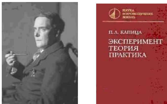
Fig.1. Peter Kapitsa and his famous book "Experiment, Theory, Practice"