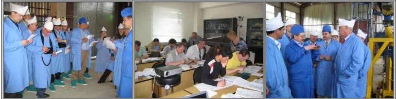
Fig. 3. Some pictures from practical and theoretical exercises, IAEA Training Course, 2007

4. The new IAEA regional training course on the development of a national workplace monitoring programme by Member States was held in November 2007 jointly with Scientific Production Company “Doza”. The purpose of the Training course was to provide the participants with the fundamentals as well as the practical techniques essential for the establishment and implementation of a national workplace monitoring programme in full compliance with the principal IAEA requirements. Areas were covered include principal concepts, methods and equipment used for implementing workplace monitoring programme in nuclear, medical, industrial, etc, facilities using radiation sources in their practices. 21 attendees from 12 Member States including the staff of the regulatory bodies, end-users, service providers, and other professionals participated in this event. The training course consisted of lecturers and practical exercises. The structure of the course was based on three chapters covering the radiation dose rates measurements, the surface contamination measurements and the airborne contamination measurements. General principles of measurements, as well as of quality management were also provided at the beginning of the course. Exercises and measurements techniques and procedures were complete the theoretical approach.