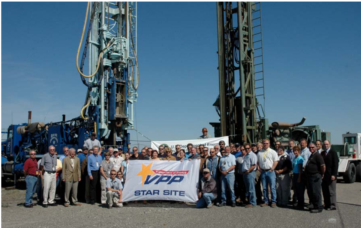
Fig. 5. SGRP workers, along with high-level DOE officials, stand near two drill rigs and celebrate as they receive their VPP Star flag in May 2007.

In 2006, the SGRP worked over 520,000 person-hours, yet remarkably both the recordable accident rate and the lost or restricted workday case rate stood at zero! The VPP self-assessment conducted that year returned an average score of 8.1. Likewise, lock-and-tag violations stood at zero in 2006, vehicle accidents declined significantly, and other safety indicators all trended in a positive direction. In mid-2007, the project reached two million hours without a day lost to an injury. At nearly the same time, the SGRP was awarded Star Status in the VPP system. Only seven first aid cases occurred during that entire year. As 2008 dawned, the projects' safe record continued, surpassing 2.2-million hours without a day lost to an injury.