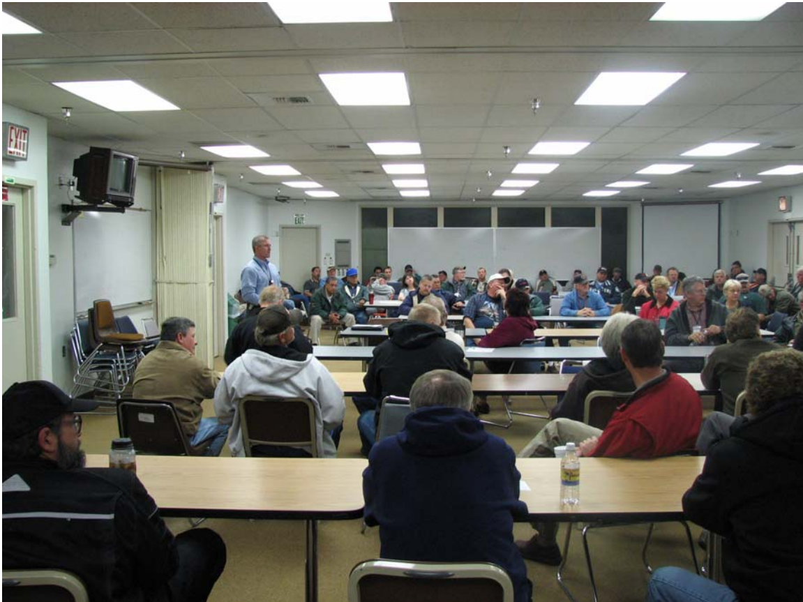
Fig. 4. Regular, open meetings between SGRP management and labor helped to improve communications about safety and reach solutions.

The groundwater EZAC had become a symposium for grumbling, but the new leaders attended every one. The safety manager even became the EZAC co-chair, and challenged the complainers to offer solutions, and kept a record of every safety concern raised. At subsequent meetings, the new leaders demonstrated their good faith by listing the problems they had investigated and corrected since the previous meeting.