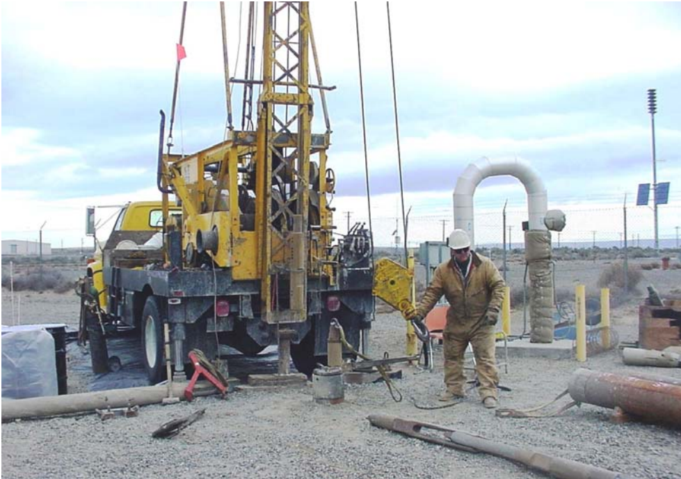
Fig. 2. A Fluor Hanford crew drills a well in the 200 Area of central Hanford, 2005.

In addition, the SGRP drills several deep boreholes each year into highly contaminated soil zones – including a unique slanted borehole under a plutonium site in 2006. It also installs dozens of aquifer tubes in steep banks along the Columbia River. Seven large pump-and-treat operations across the Hanford Site pump contaminated groundwater up and through treatment tanks and columns, and back to the soil.