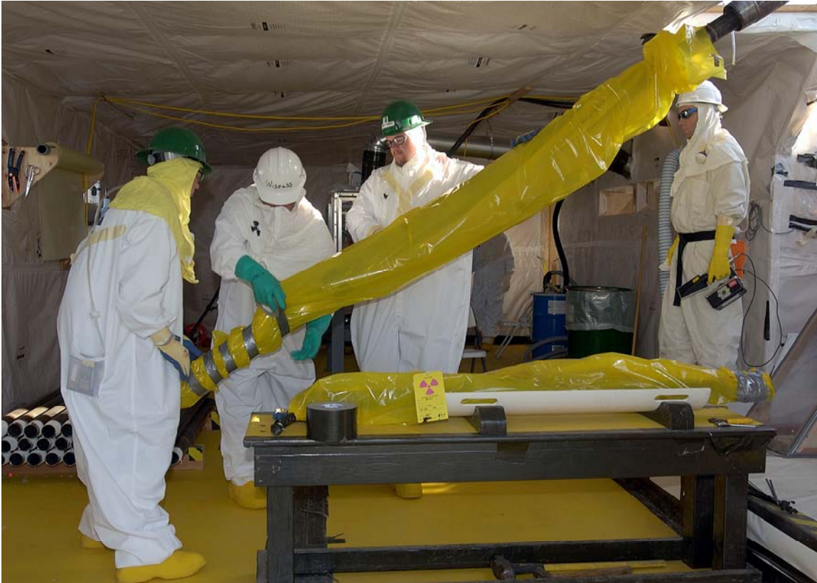
Fig. 3. Fluor Hanford workers collect and carefully handle a soil sample containing plutonium, 2006.

other materials found or spilled in the course of Site work. The number and volume of samples collected in 2007 all represent approximately a ten percent increase over the previous year, and the 2008 numbers are growing by yet another ten percent. In addition, hundreds of soil and waste site samples are collected each year.