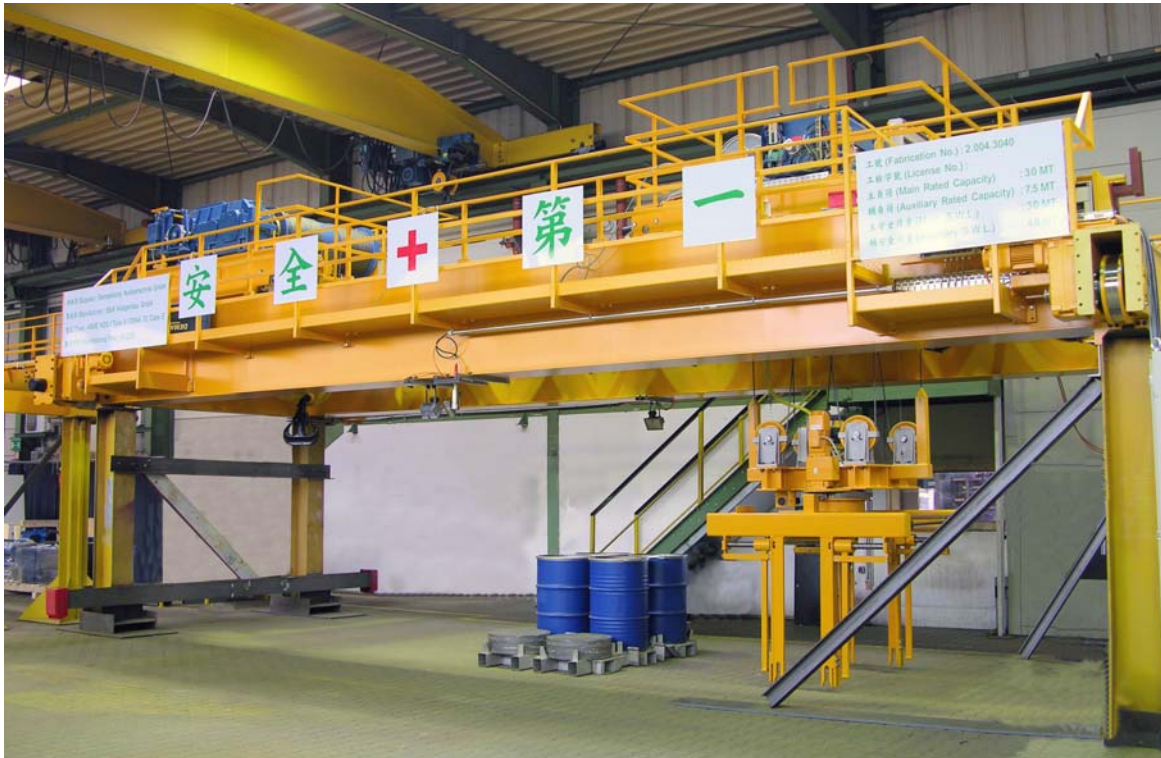
Fig.2: Container/Pallet Handling Crane during Shop Test Inspection

Handling Trolley (7.5 mts) will be required for pickup the drums/pallet assembly from the container. The pallet grab with a powered rotating block can move and rotate the pallet to unload it at the assigned position.