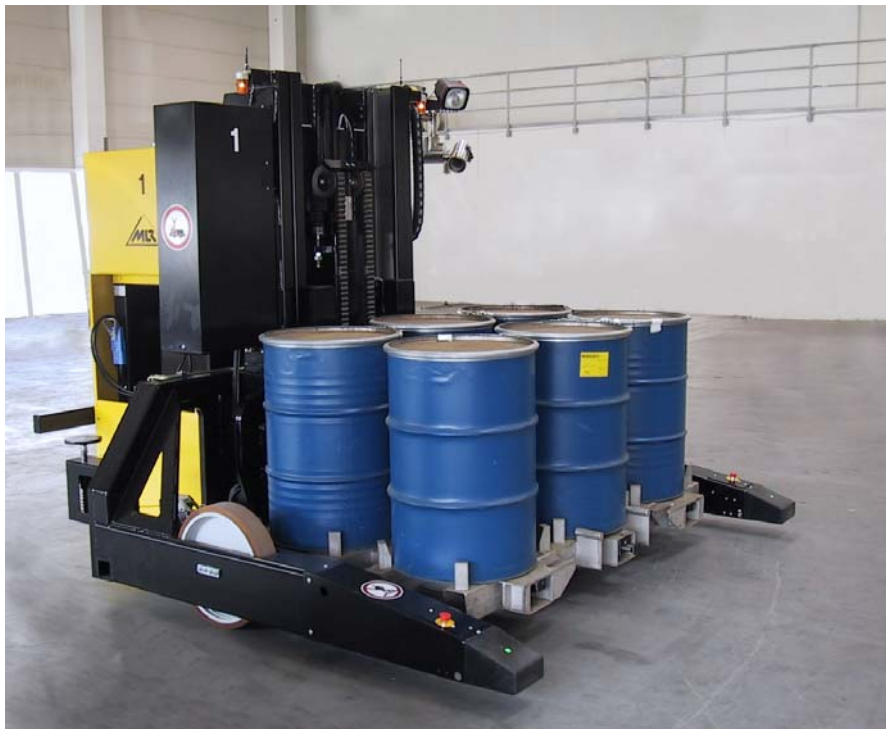
Fig. 3: AGV loaded with drum/pallet assembly

Both AGVs are powered by rechargeable batteries with a capacity of eight hours continuous operation. The vehicles are equipped with obstacle detectors to prevent any collisions when driving forwards or backwards. Figure 3 shows an Automatic Guided Vehicle during Shop Test execution.