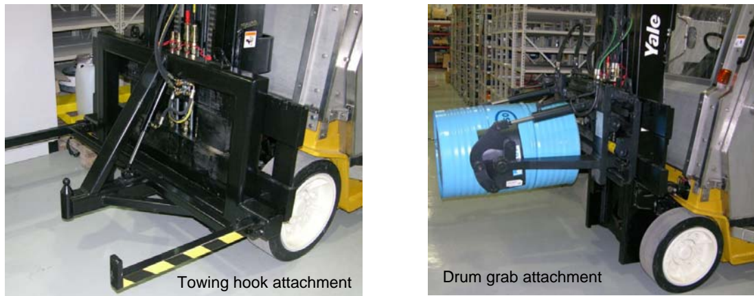
Fig. 4: Shielded Manually Operated Forklift (SMOF)