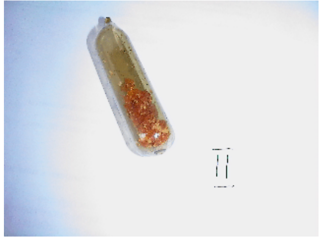
Fig. 4 Irradiation at 77 Mega-rad

The research program has proven the effectiveness and viability of the polymer systems for use with radioactive liquids and for wide ranging applications.