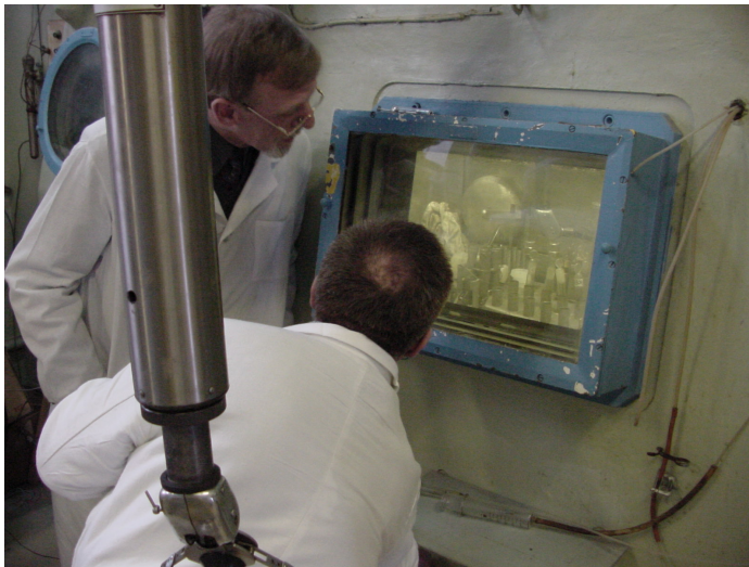
Fig. 5 Solidification Tests at Gatchyna

Nochar, Inc. (polymer technologist/ manufacturer, Indianapolis)