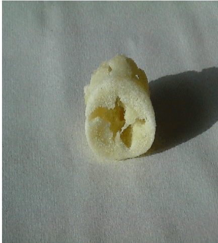
Fig. 3 Organic / Nitric Solidification (Dodecane + di-2 ethyl, hexyl phosphoric acid 0.25M)

An important aspect of the test program was to evaluate leaching and stability of the solidified waste form. Gamma irradiation (Cobalt 60 source, at 30 rad per second) was applied to the solid waste forms and analysis proved that there was no polymer degradation and no leaching following high dose irradiation. After 30 days or 77,000,000 rad, the sample was hard and no liquid present. The ampoule was then placed into the irradiator for an additional 73 days of exposure for a total of 270,000,000 rad. The sample became brittle and broke into 2 pieces.