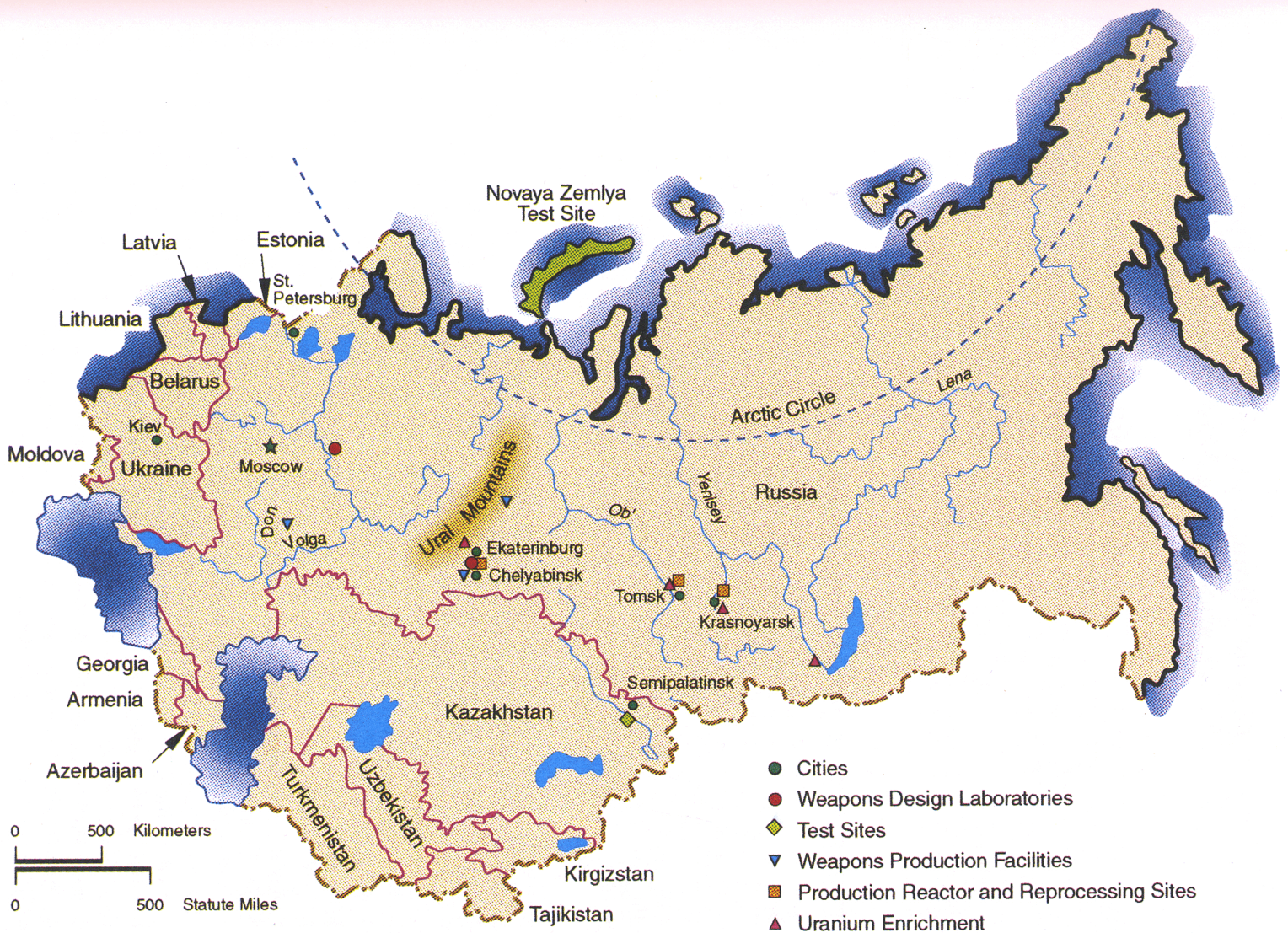
Figure 4.2. Russian Weapons Complex