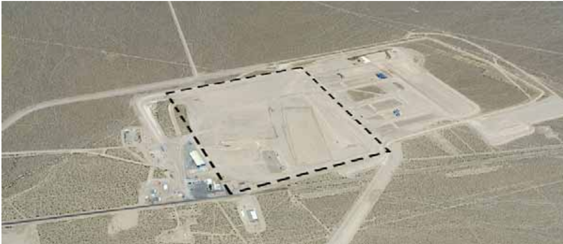
Figure 1. Area 5 radioactive waste management site with “92-acre” site outlined

“92-acre” site (Figure 1) of the Area 5 RWMS. This activity, if approved by the State of Nevada, will consist of placing native alluvium soil in the spaces between and above the disposal units, creating a uniform 2.4 m (8 foot) mono-layer cap [1].