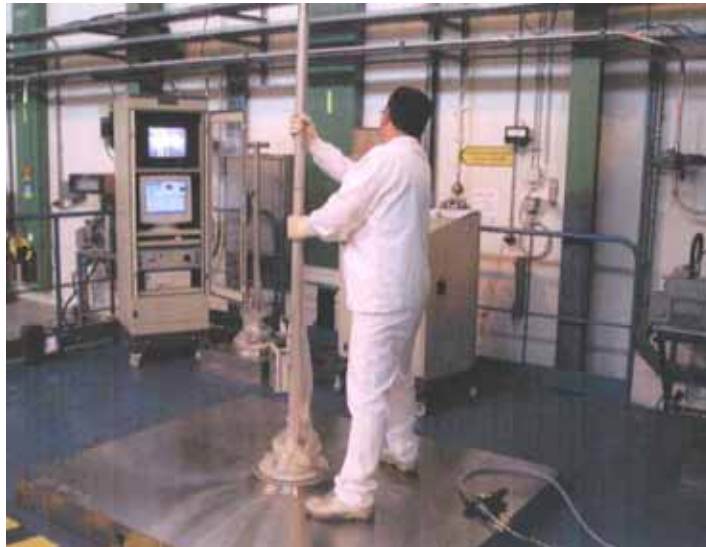
Fig. 2. Operators pumping sludge at Marcoule required little protective equipment. [6]

Before the sludge-pumping system was put into service, a full-scale demonstration test was conducted and the proven system was installed in 2004 in Basin #14. Average retrieval rates up to 600 kg of sludge per day were achieved. The sludge will be grouted using an advanced batch-grouting process. [6]