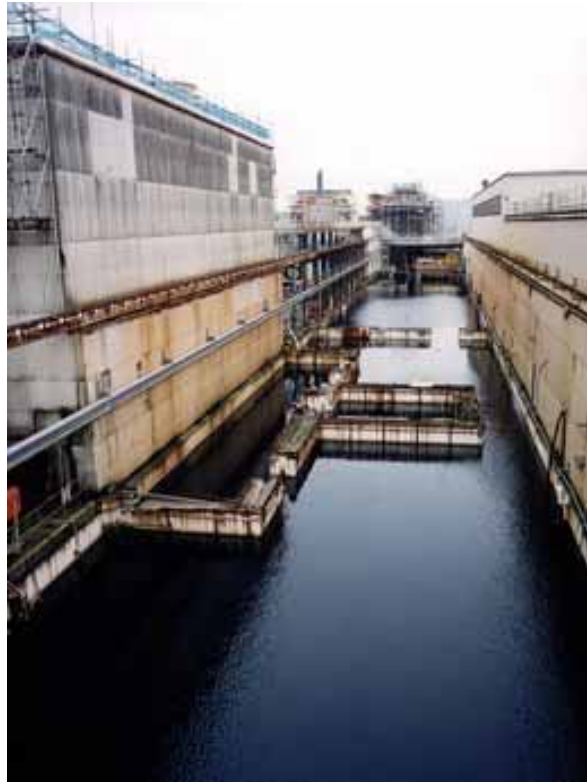
Fig. 3. The MSDF pond at Sellafield is not enclosed. [7]