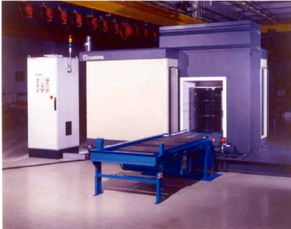
Fig. 1. HENC assay system for installed operations.