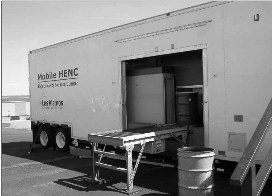
Fig. 2. Mobile HENC assay system.