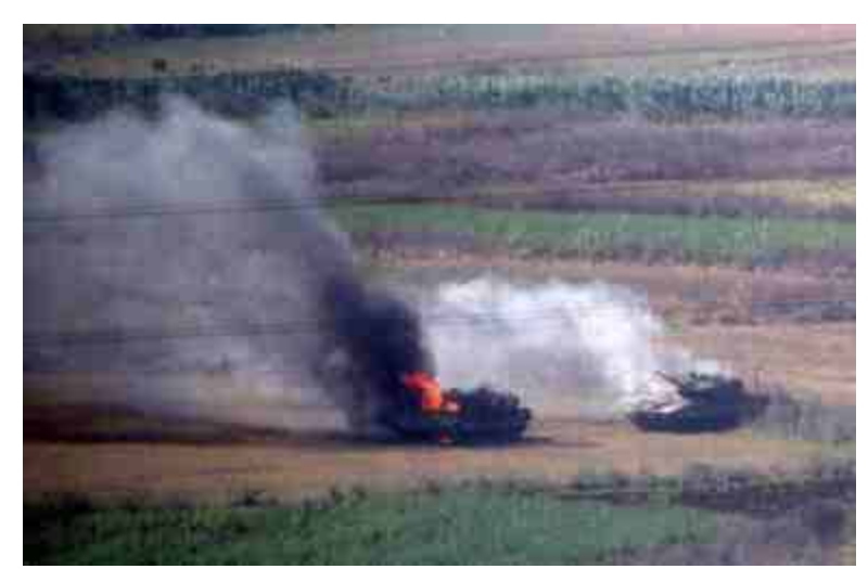
Fig.1. Israeli tanks burning after being hit by AT 5 anti-tank missiles.

Conflict, Israeli armor casualties were extraordinarily high due to the aggressive interception of Israeli radio communications, tactical alteration by adversaries, and the use of fourth generation anti-armor warheads on anti-tank missiles. These warheads are designed to penetrate the armor with multiple charges that explode to kill the vehicle crew members.