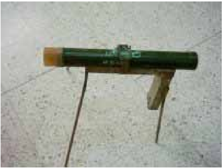
Fig.2. Anti-armor roadside improvised explosive device (IED)

Beside the new applications in IED, insurgents are deploying new kinds of armor penetration technology to defeat armored vehicles. The newest technology is the use of explosively formed projectiles (EFP) in IED's. EFP's are a relatively new type of shaped charge used against more lightly armored targets. While the penetration is generally less than a conventional shaped charge, the diameter of the hole created by these new generation charges is wider. Additionally, the caliber of the weapon necessary for initiation of the attack is smaller. Essentially, the conflict between armor protection and armor penetration that has been static since the introduction of ceramic armor thirty years ago, has become a race between protection and increasing penetration power. The implications for vulnerable shipments seem clear.(25,26,27,28,29)