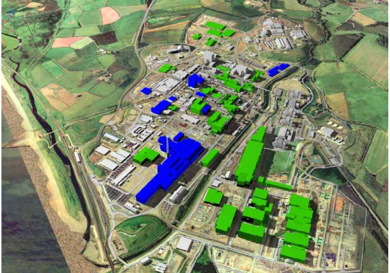
Figure 4 GIS of Sellafield site in 2025