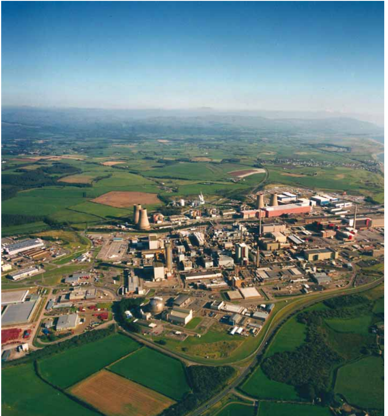
Figure 1 Sellafield Site

must be decommissioned and demolished. The site is both a major asset to the UK and its major source of nuclear liabilities, over 80% of the UK nuclear material is stored on the site.