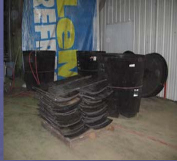
Century 21 Containers