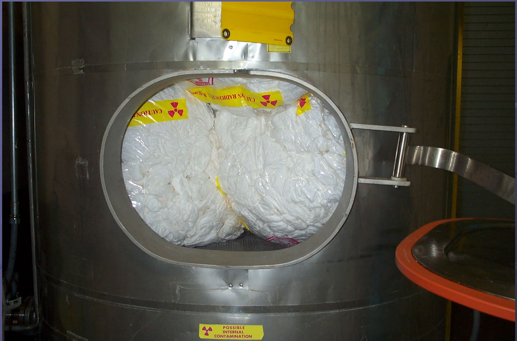
RadBags Loaded into the Processor