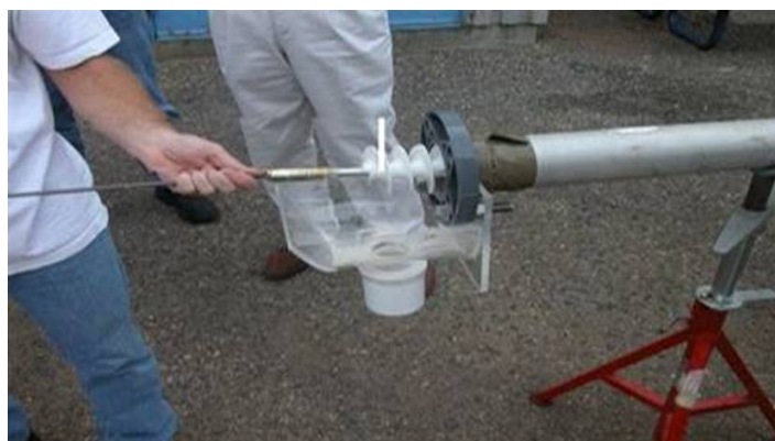
Fig. 3. Demonstration of PFP's special augers

PFP's special augers (Fig. 3), machined out of Teflon TM6 blocks and mounted on stainless steel cores, are being used with "quick connect" extension rods to clean out legacy plutonium-bearing materials held up in piping. The extension rods can be added as needed to reach legacy material in the lines. The auger is simply pushed into a pipe, rotated, and pulled out, with the held-up material dropping into pre-staged, critically safe containers through a transparent "tee" (short branch) attached to a line flange. Special scrapers, brushes, and core drill bits have also been developed by PFP D&D teams to address various challenges. Larger versions of the auger also are being used to clean out the mercury vacuum headers in PFP's duct level between the first and third floors. In many cases, the augers have allowed hold-up removal to proceed without actually removing pipes, thus saving time.