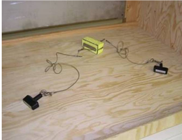
Fig. 1. “Sponge Bob” and magnets arrangement for D&D

encountered during the D&D process. NDA is used to determine the level of contamination of an object.