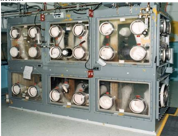
Fig. 2. Glovebox decontamination at PFP

Glovebox decontamination at PFP (Fig. 2) is facilitated by the use of decontamination systems using cerium nitrate and certain proprietary chemical decontamination processes. Most of the process equipment and gloveboxes at PFP are contaminated with transuranic (TRU) waste. If the equipment is not decontaminated, it must all be disposed at the Waste Isolation Pilot Plant as TRU waste. This is not advantageous from a cost and waste minimization standpoint. PFP scientists and management determined that a more practical and efficient method to the D&D of this equipment would be to decontaminate the equipment from a TRU level to a low level and dispose of the equipment as low level waste. Wet and dry methods of decontamination technology were investigated at PFP by PFP and Pacific Northwest National Laboratory (PNNL) chemists and technicians.