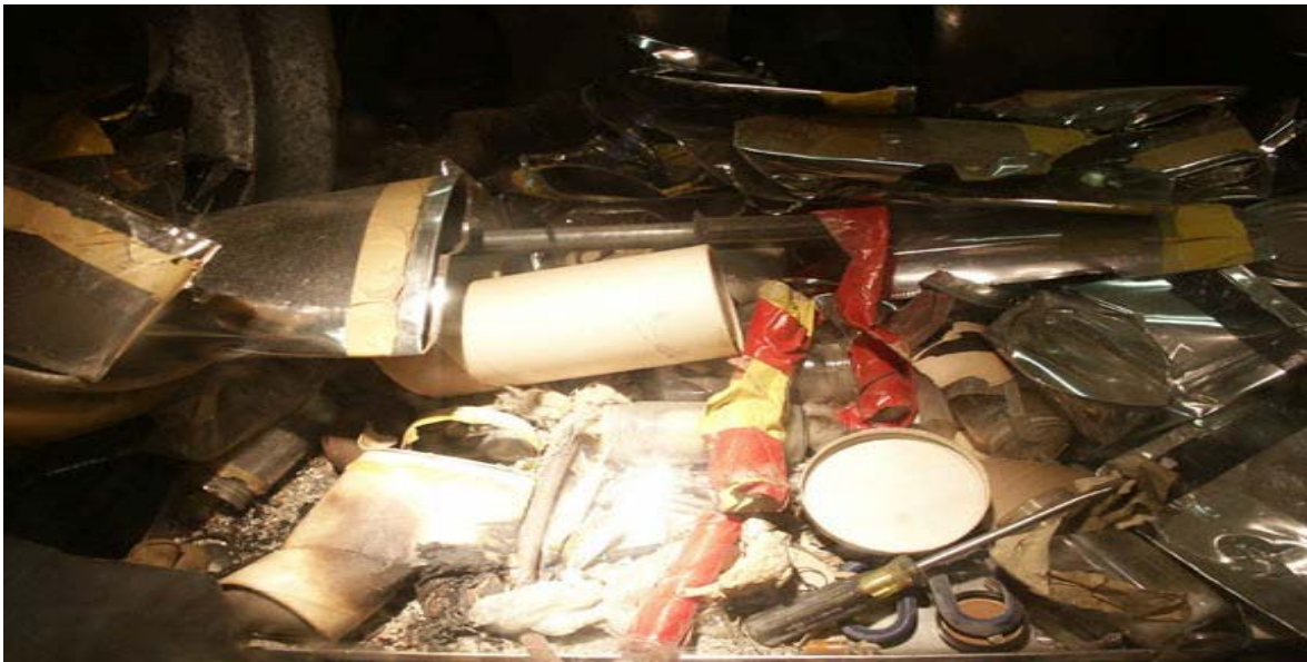
Fig. 2. Contents of legacy Lawrence Berkley Laboratory drum in the NTS VERB glovebox

Early on in the characterization process it was evident that the projected reject rate for drums of 5 to 10 percent was too low and the actual rate would be 30 percent or higher. The lack of a comprehensive historical AK, and stringent controls during waste generation, contributed to the increase, although a waste generator in the 1970s could not have foreseen the stringent requirements for 21 st century waste disposal. This resulted in a large increase in the number of drums processed through the glovebox for PIR, or repackage to reposition radioactive material in a drum to reduce the surface exposure rate and change the classification of a drum from Remote-Handled (not allowed for WIPP disposal under NTS certification) to Contact-Handled. Rejected drums and containers were identified throughout the process from initial physical inspection through to development of the final loading manifest.