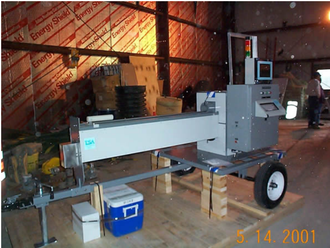
Fig. 2. The Linde core scanner.

The approach selected was to apply the subsurface SOR ROD requirement to each 15 centimeter (cm) interval at depth. Establishing compliance for each 100-m 2 area and each 15-cm depth down to native soil in Class 2 and 3 areas again presented a potentially enormous number of physical samples. Fortunately, the cleanup requirements for subsurface soils in the ROD allowed the use of real-time screening techniques to be applied to subsurface soil cores. A customized core scanner was developed (see Fig. 2.), and a Geoprobe system was used to obtain cores.