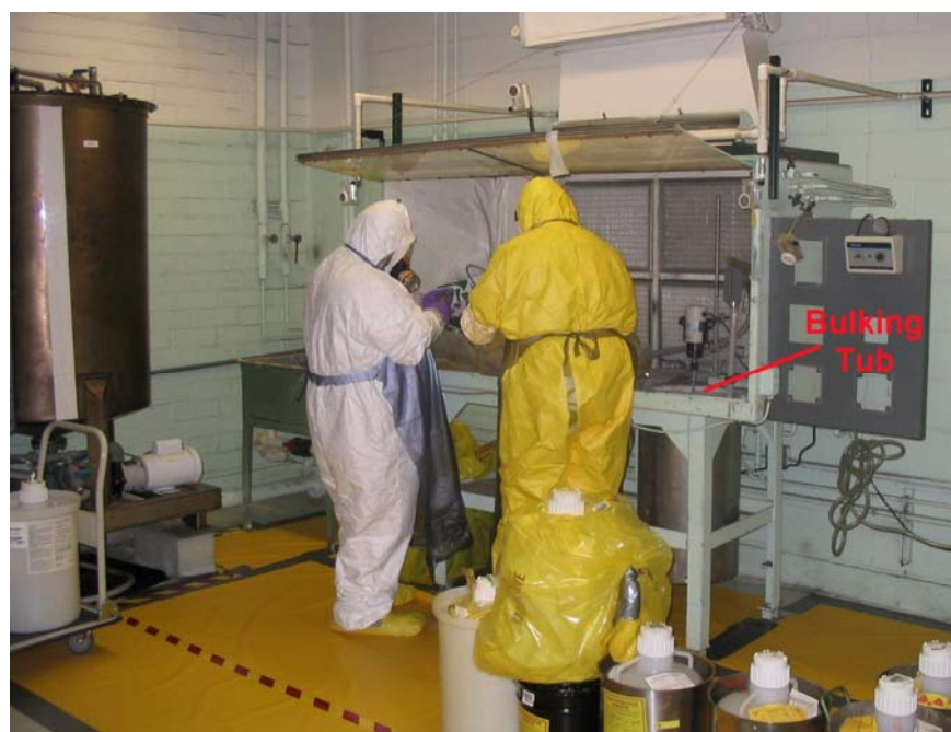
Fig. 4. Workers Bulking Less Than 5-Gallon Containers in Exhaust Hood Bulking Tub

The first batch of waste was treated in the AMWTS on September 29, 2004 (see Fig. 4) with seven subsequent batches treated thereafter. Table II summarizes the analytical results for these first eight batches treated in the AMWTS. Six of the eight treatment batches were treated successfully. The two that were unsuccessful (AMWTS-003/004 and AMWTS-009) failed the UTS for leachable mercury (0.027 and 0.035 mg/L, respectively). These results were only slightly higher than the UTS of 0.025 mg/L. These mercury concentrations were attributed to high mercury loading in one container in each of the batches. This mercury content is considered an anomaly and is not expected in future treatment batches since this waste stream source is no longer present at ANL. These treated waste containers will be shipped to Envirocare of Utah for further stabilization treatment.