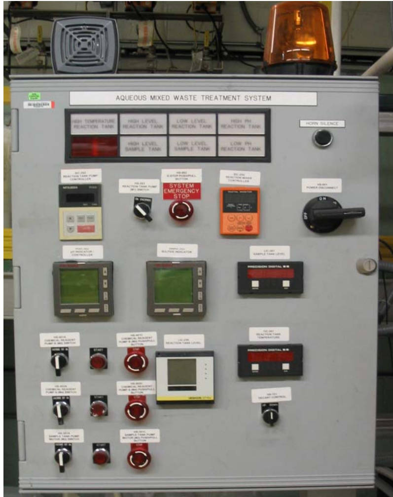
Fig. 3. AMWTS Control Panel