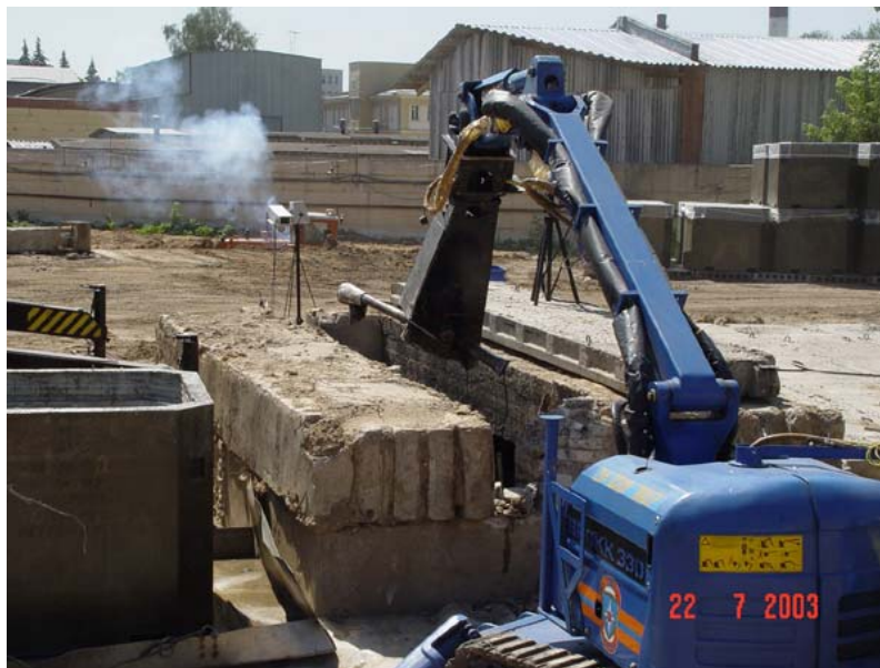
Fig. 4. Radwaste withdrawal by the Sweden robot “Brokk 330”

The same power shovels but equipped with a hydraulic hammer were used to crush concrete structures. Truck cranes and manual handling devices were also used to withdraw the radwaste. Robotics available at the RF Ministry of Emergency – “Brokk-110” and “Brokk-330” robots produced in Sweden - were tried out when withdrawing high level waste and liquidating one of the old repositories (Fig. 4).