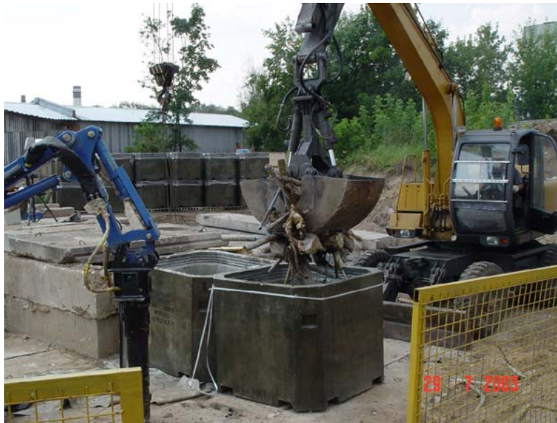
Fig. 3. Radwaste withdrawal by construction machinery

The same power shovels but equipped with a hydraulic hammer were used to crush concrete structures. Truck cranes and manual handling devices were also used to withdraw the radwaste. Robotics available at the RF Ministry of Emergency – “Brokk-110” and “Brokk-330” robots produced in Sweden - were tried out when withdrawing high level waste and liquidating one of the old repositories (Fig. 4).