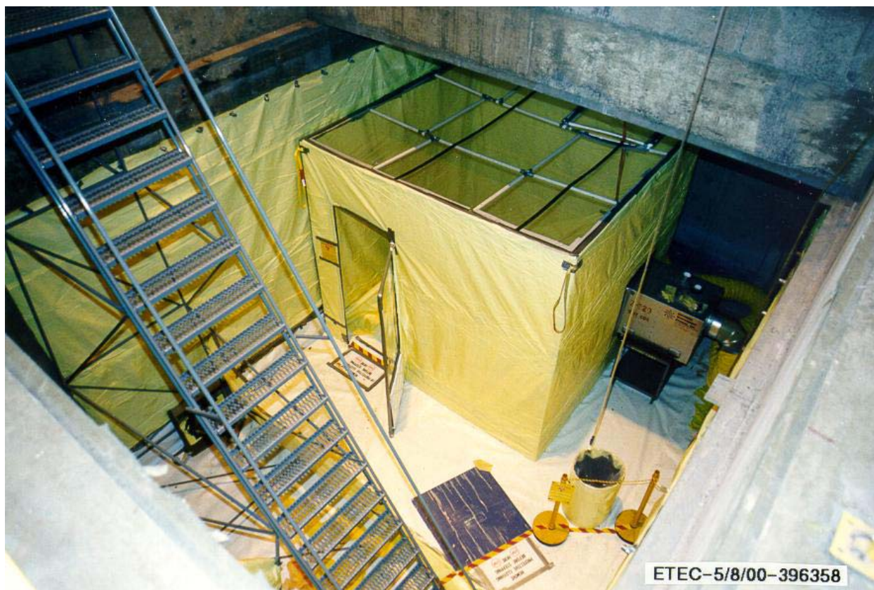
Fig. 2 Temporary containment structure fabricated for TRU waste repackaging activities

and a clear tent top for observation. Multiple plastic layers were used within the enclosure to allow change-out for contamination control, and five video cameras were installed to document operations.