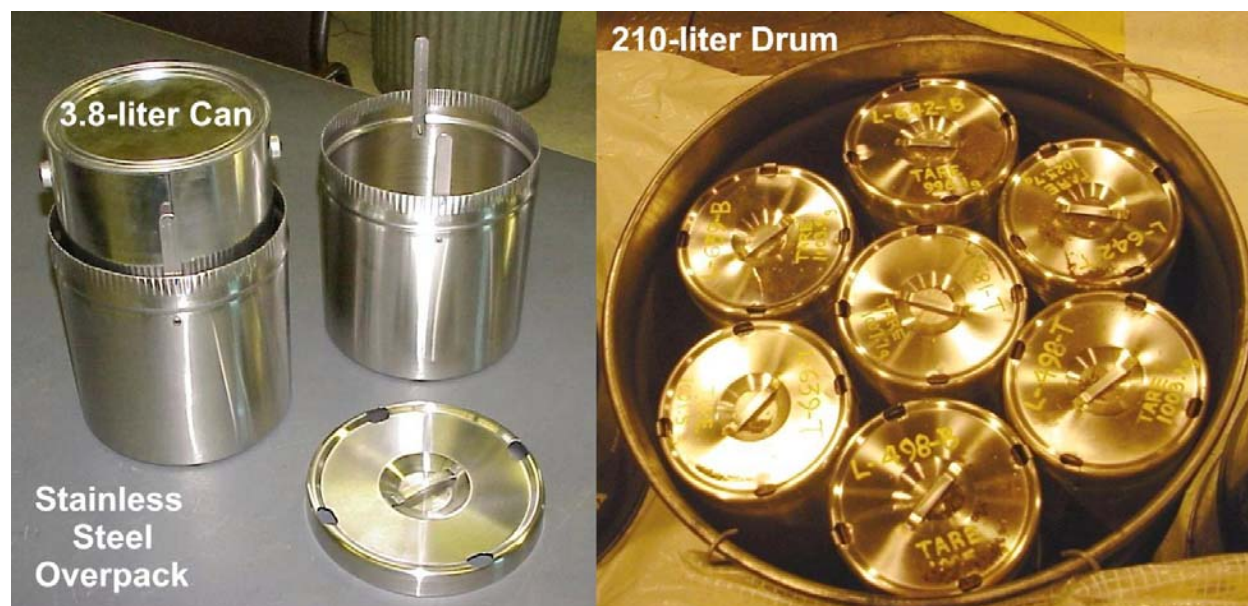
Fig. 3 Overpack Containers Used for the Remote-Handled Waste, and Loading Geometry in a Remote-Handled Drum.

tools to reduce personnel exposure during handling. All of the 3.8-liter paint cans were overpacked in this manner. Several additional overpack containers were also fabricated for repackaging the PCB-containing sludge material when EPA and DOE approvals were granted.