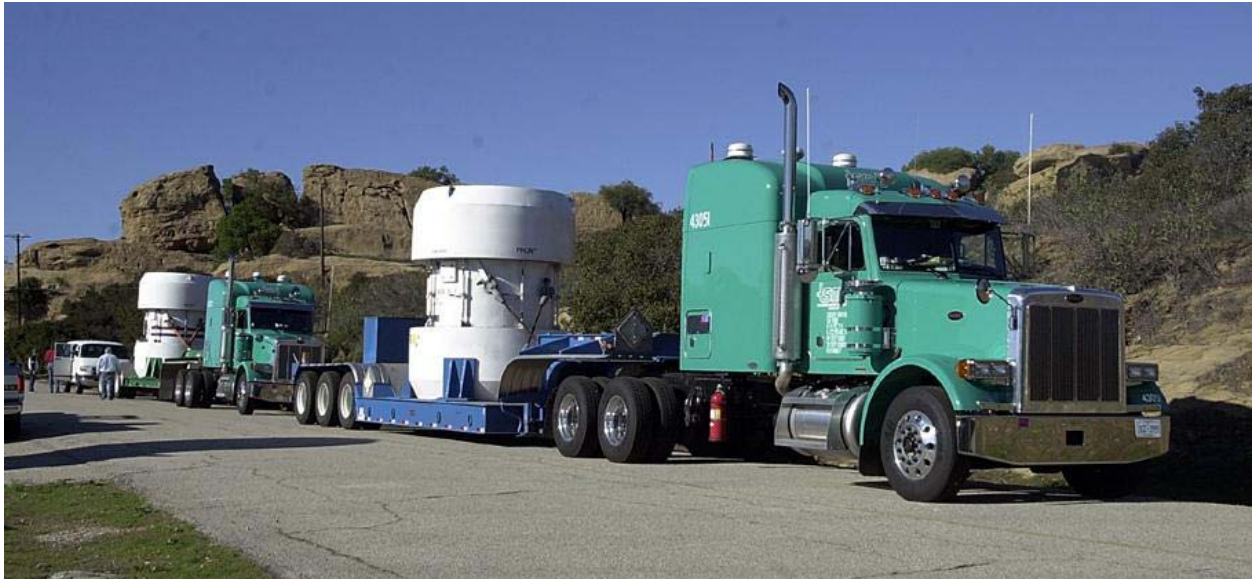
Fig. 4 Loaded CNS 10-160B Casks and Emergency Response Van Staged for Shipment

The two loaded CNS 10-160B casks and transport vehicles were inspected on the morning of December 18 and the TRU was shipped off-site that afternoon (Fig. 4). Emergency response capabilities were provided by a van of DOE-CBFO personnel that followed the shipment. The shipment was tracked by both DOE and the State of California using the DOE Transportation Tracking and Communication System (TRANSCOM) and passed through northern California a few hours before the predicted snowstorm closed the highway. The overweight status of the shipments did cause delays in Oregon to resolve permit issues and to stop highway traffic at a bridge to cross one tractor/cask rig at a time. The TRU shipment successfully arrived at the Hanford site in the early morning of December 20, 2002.