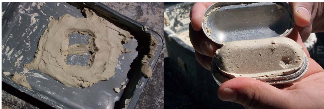
Fig. 2 Shallow layer sampling test example

Some operational improvements were suggested as well. CH2M Hill operations staff requested that the clamshell removal be modified to allow more rapid removal of the clamshells. Additionally, several suggestions were made regarding the deployment system. A revised cranking system that would use both hands and require less effort (using a winch or gear reduction). The operators requested a braking system similar to the ratcheting winches used on the finger trap and grab samplers. Most significantly was the request to incorporate the system into a re-useable glove box. This would reduce the dose to the sampling crew, minimize potential for exposure, and reduce cost through the re-use of equipment. Grab and fingertrap sampling operations usually require disposal of the glove bag, deployment winch, and sampler.