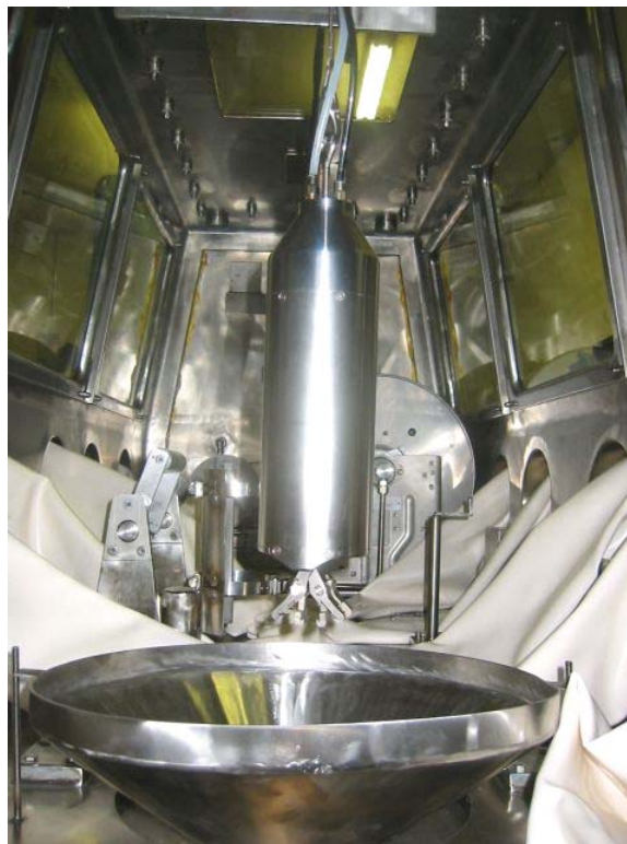
Fig. 4 Interior view of completed below-riser clamshell sampler system

A second attempt was made on December 2, 2003 at the same location. During this attempt the sampler was deployed into the same sludge, but water additions to the tank increased the liquid depth by several inches. During this attempt, a nearly full sample was obtained and retrieved into the glovebox. However, some liquid was observed when the sampler was tilted for removal of the clamshells. The clamshells appeared tightly closed. When opened, the clamshells were full of a thick, clay-like material. The sample was not sent to the laboratory since no suitable plastic containers were available at the time. The use of glass in gloveboxes is limited due to concerns regarding broken glass and the polymer gloves used. Due to schedule interfaces with other projects (the riser was scheduled for equipment installation later that day), there was insufficient time to recover a suitable container so the material could be shipped to the laboratory for analysis. Some portion of the observed leakage may have come from the clamshells. Overall, the event demonstrated the sampler is effective at recovering samples from difficult to sample materials and easily operated in the field.