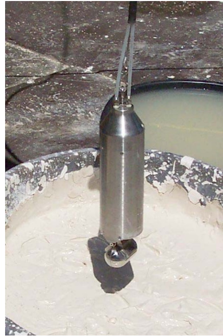
Fig. 1 Clamshell sampler