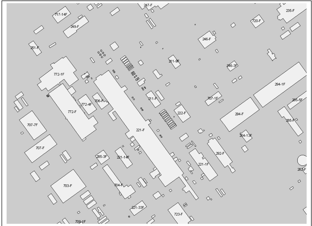
Fig. 1 F-Area Canyon (211-F and Sand Filters (291-f and 291-1F)).