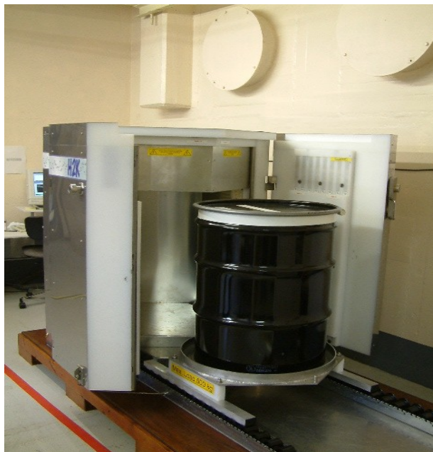
Fig. 2 The Hexagon 2000 Passive Neutron Coincidence Counter.

A third NDT technique, neutron monitoring, was introduced at WQCL in 2002 and this will be re-installed in the new WQCL. The Hexagon 2000 passive neutron coincidence counter was designed and built by SCK•CEN in Belgium (Fig. 2). The instrument has a detection efficiency of 24% and uses computed neutron coincidence counting (via a time interval analyzer), rossi-alpha counting statistics and improved filtering of high multiplicity cosmic induced events to detect sub-milligram levels of plutonium in waste drums [9].