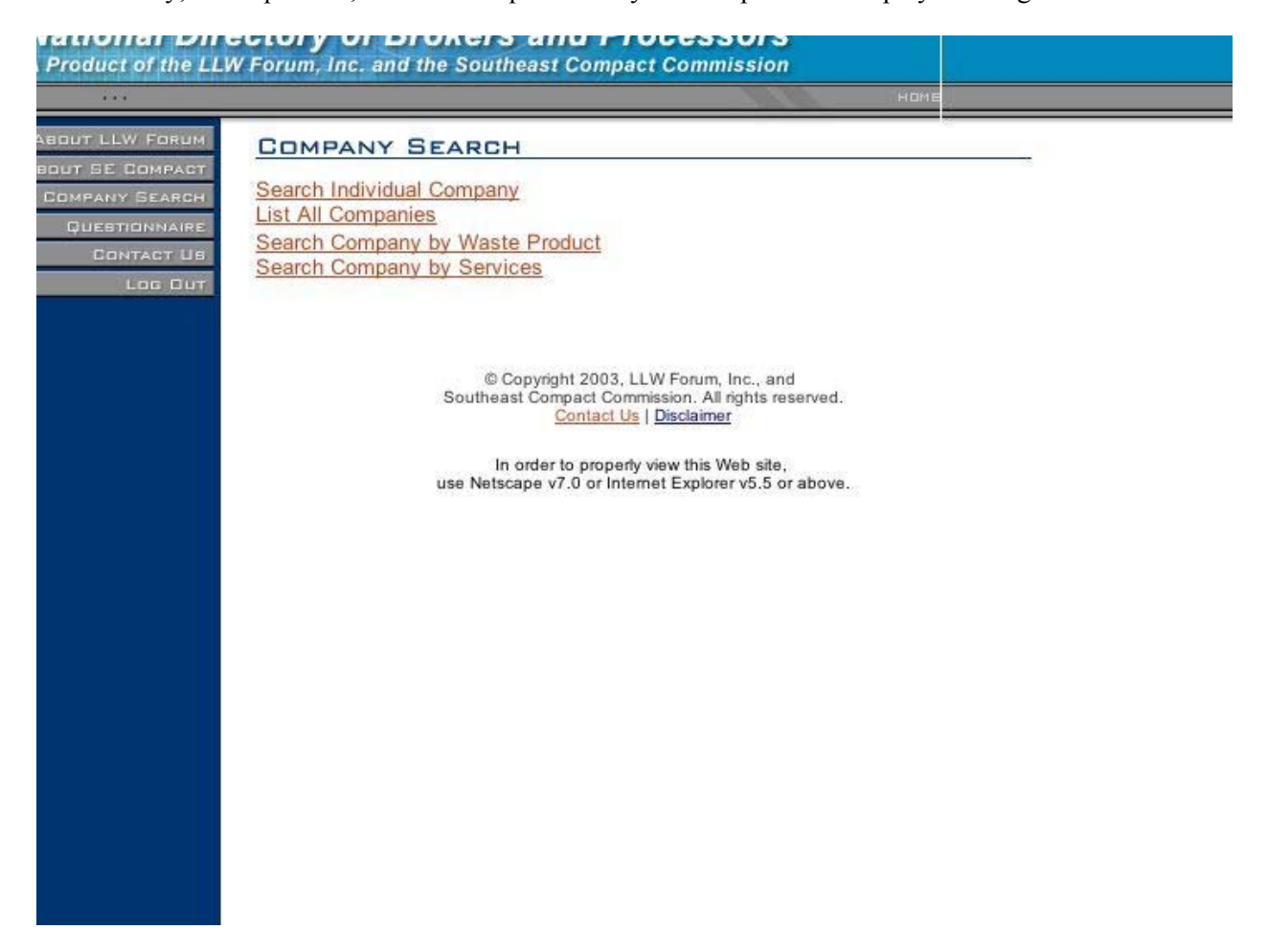
Fig. 1 Directory Search Engine

The search engine enables users of the directory to look for brokers and processors who meet their particular needs. Users may search by individual company name, an alphabetical list of all companies in the directory, waste product, and services provided by the companies as displayed in Fig. 1.