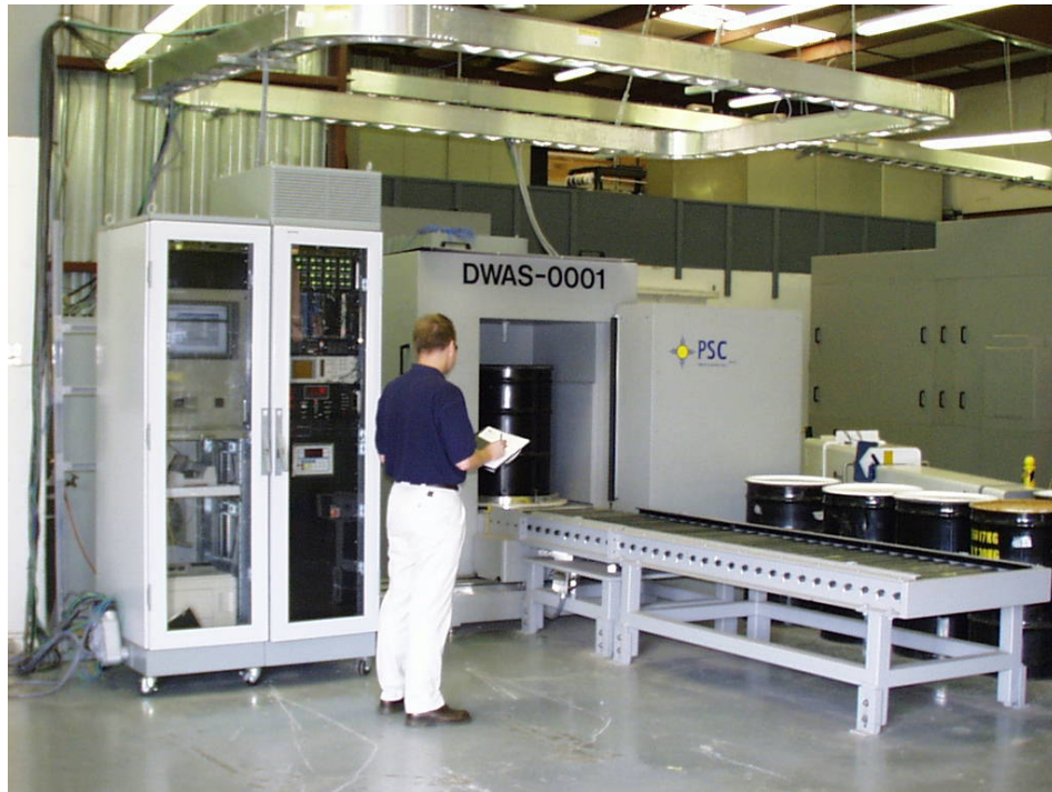
Fig. 3 IPAN System.

The IPAN neutron measurement technique (Fig. 3) combined with GEA measurements and AK data have been successfully developed into analytical methodologies to perform WIPP certified measurements on containers of Contact Handled (CH) waste designated for disposal at the WIPP. These systems have been demonstrated to meet the sensitivity requirement to perform Low Level Waste (LLW)/TRU sorting capability at the 100 nCi/g level for both 55 gallon drums and for large waste crates [4].